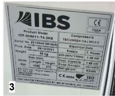
Unit 3 Floor Mounted