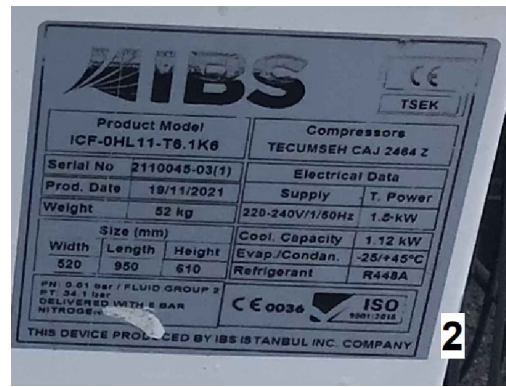
Unit 2 Floor Mounted