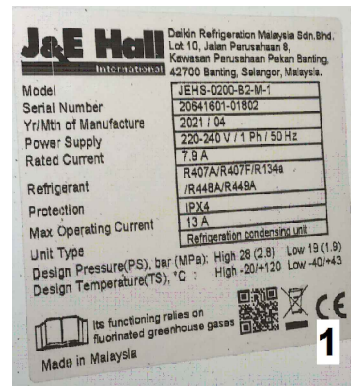
Unit 1 Wall Mounted