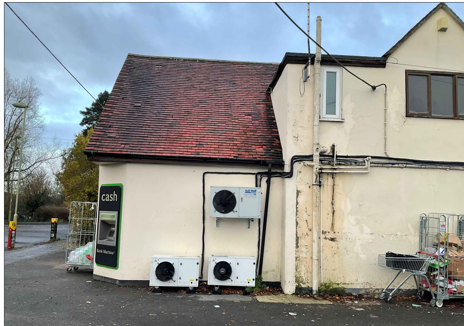
Site Photograph From Addison Square