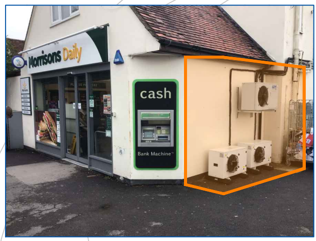
3 Number Air Conditioning Units