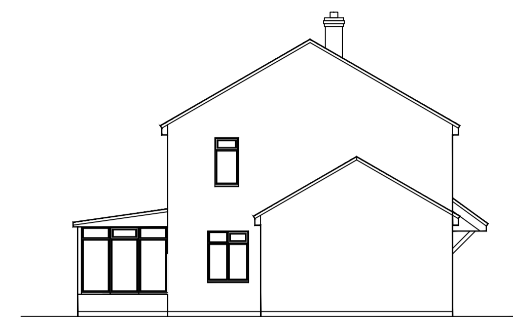
EXISTING SIDE ELEVATION 1:100