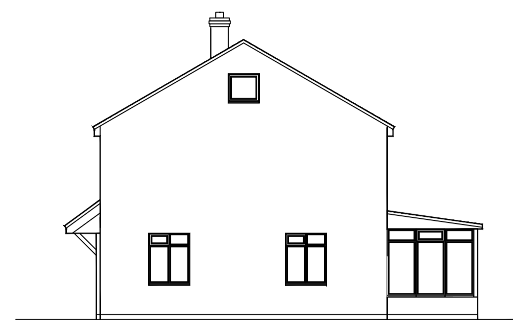
EXISTING SIDE ELEVATION 1:100