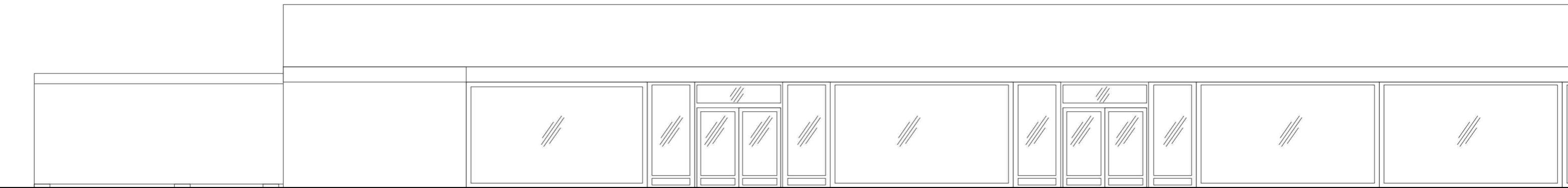
Marquee West Elevation - North End