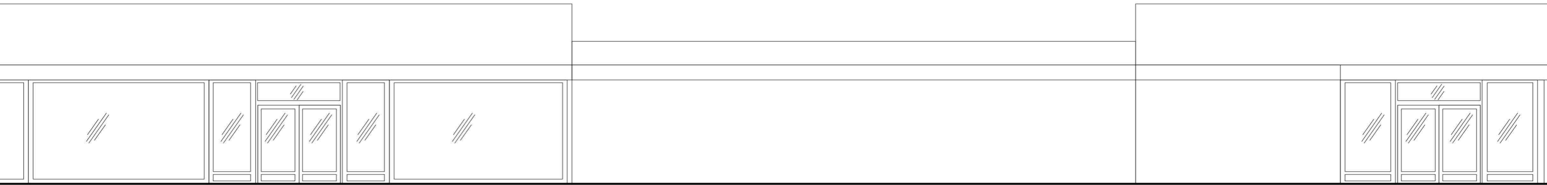
Marquee West Elevation - South End