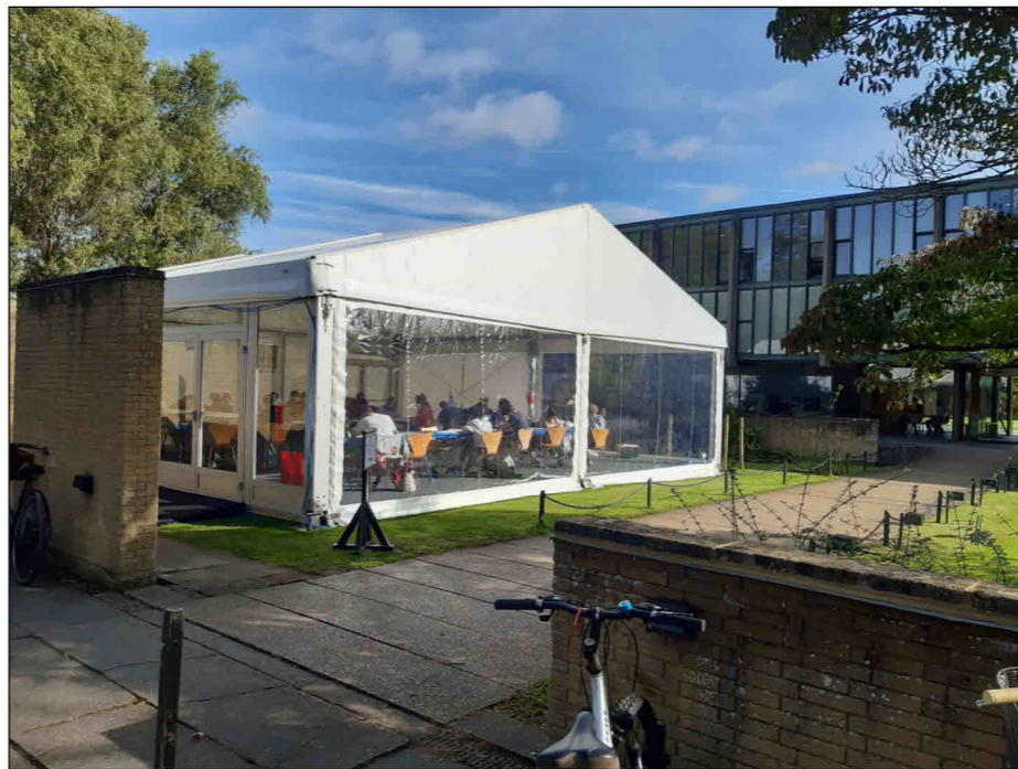
View 5 Looking north-east at south end of marquee