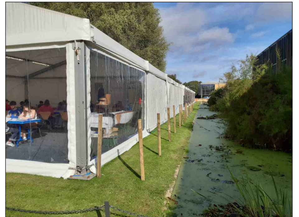
View 6 Looking north from bridge to staircase 14