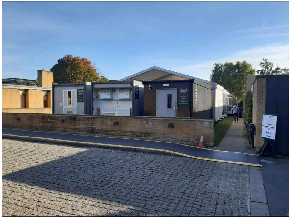
View 1 Looking south-east from main entrance area to temporary kitchen