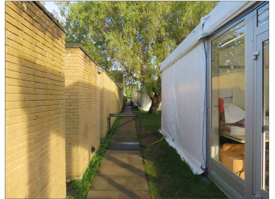
View 3 Looking north between marquee & Master's Lodgings garden wall