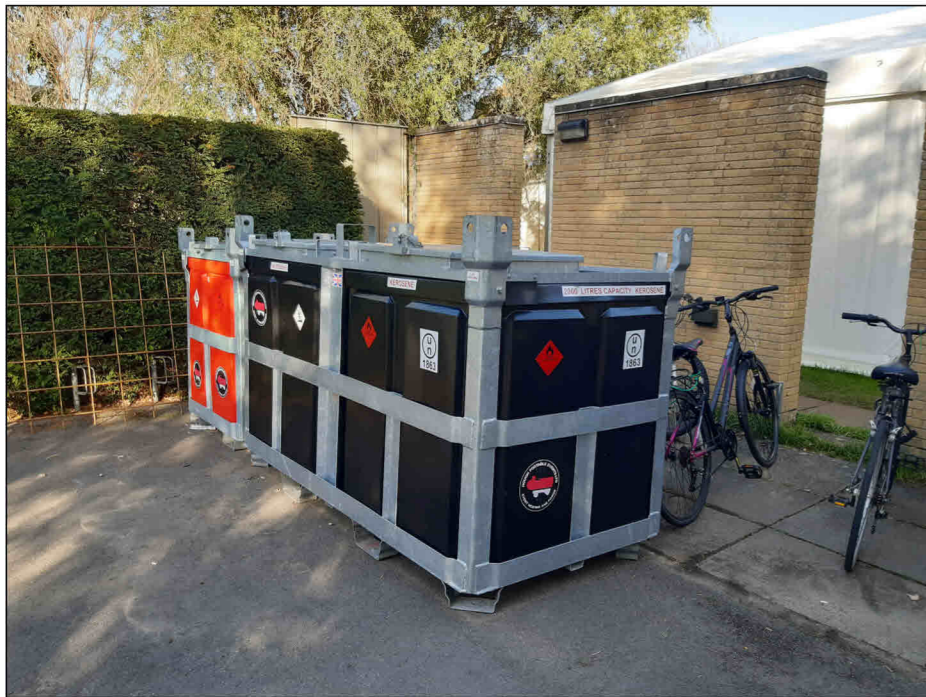
View 4 Looking at fuel store