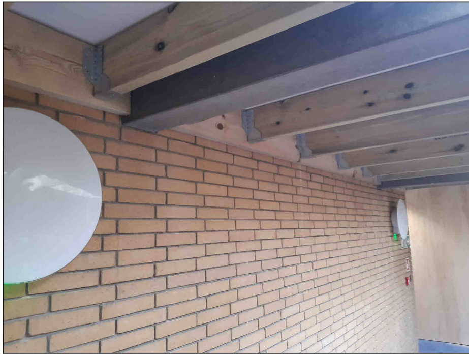
View 15 In staircase, looking across top of stairs with temporary joists fixed to walls