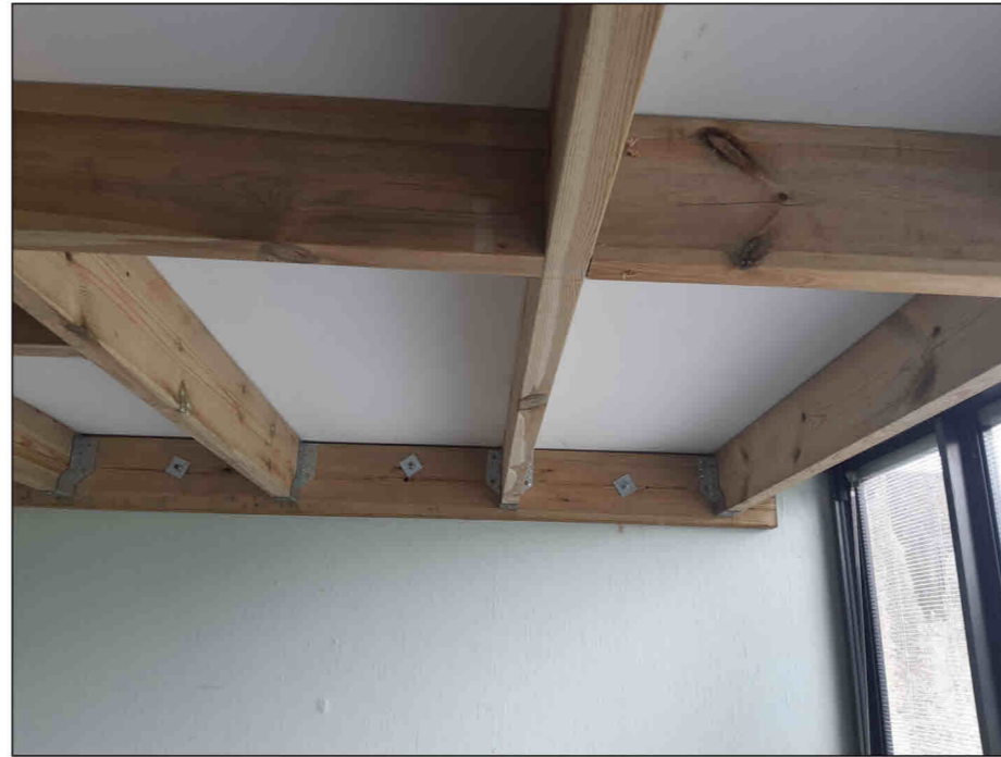
View 16 In study bedroom, looking at temporary roof support joists fixed to walls between rooms