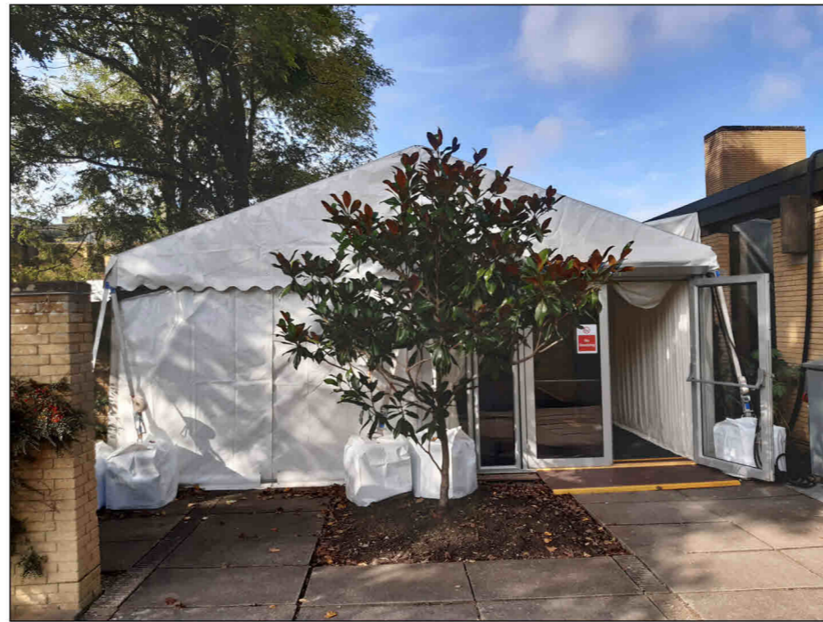
View 12 Looking west to marquee alongside JCR