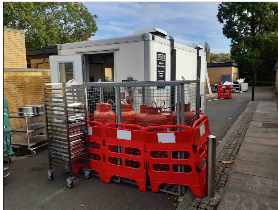
View 14 Looking north-east to temporary kitchen