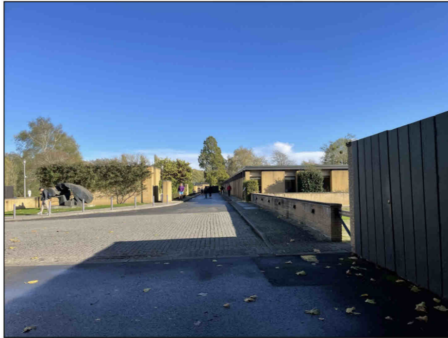
View 2 Looking east across main entrance area