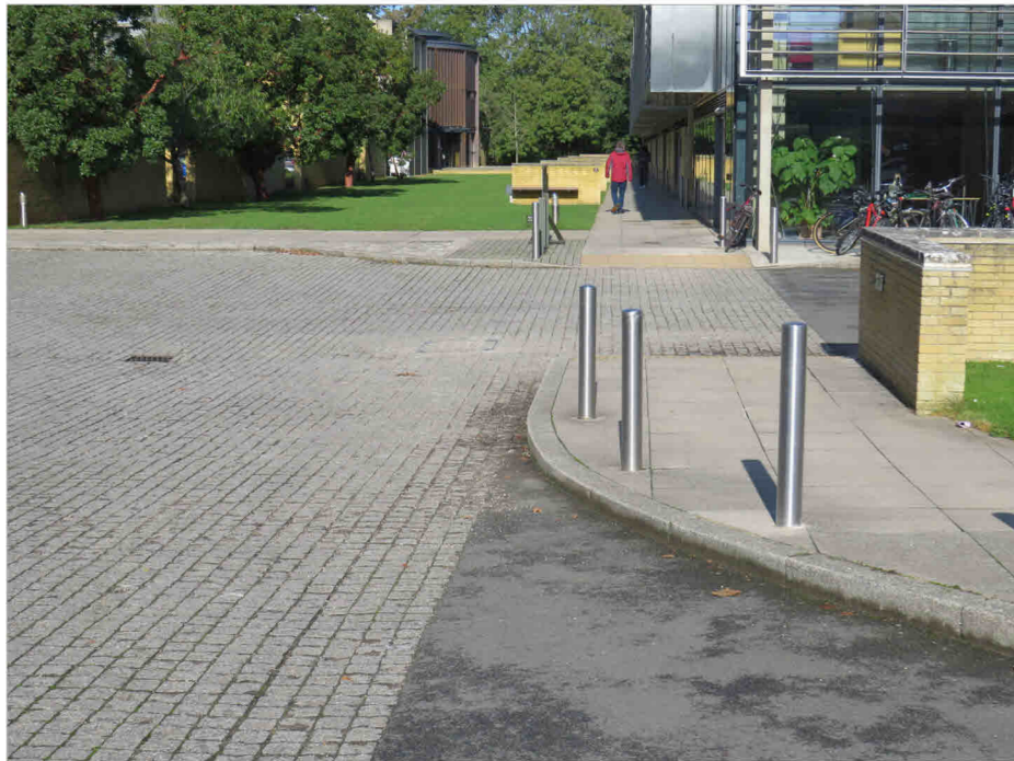
View 4 Looking north across main entrance area