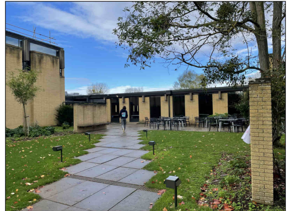
View 6 Looking north-west in JCR garden