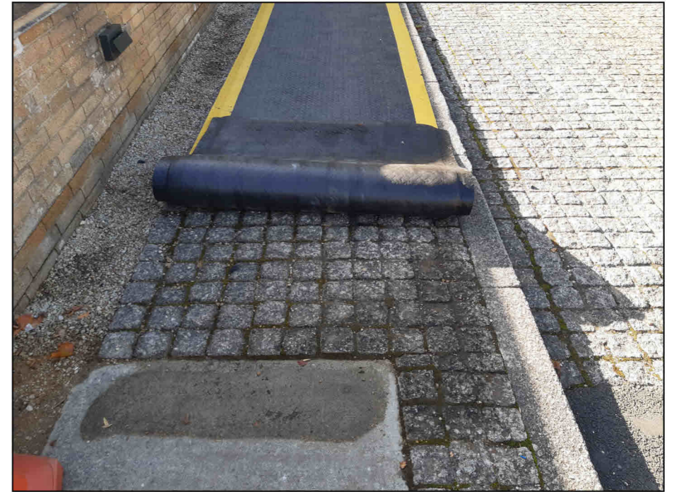
View 3 Detail of existing paving slabs & granite setts along south side of main entrance area