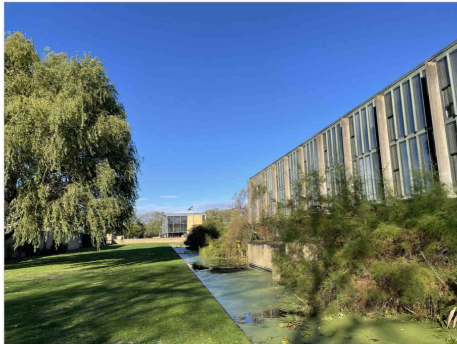
View 5 Looking north across from path to staircase 14