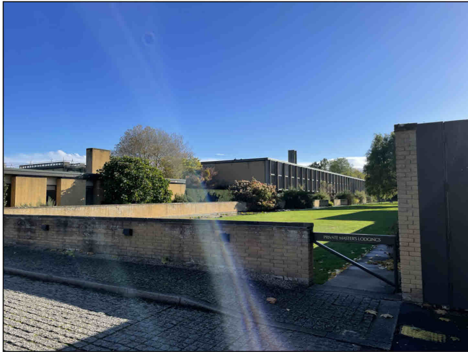
View 1 Looking south-east from main entrance area