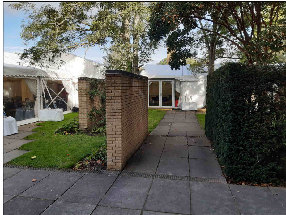
View 9 Looking north-west to marquee with JCR behind