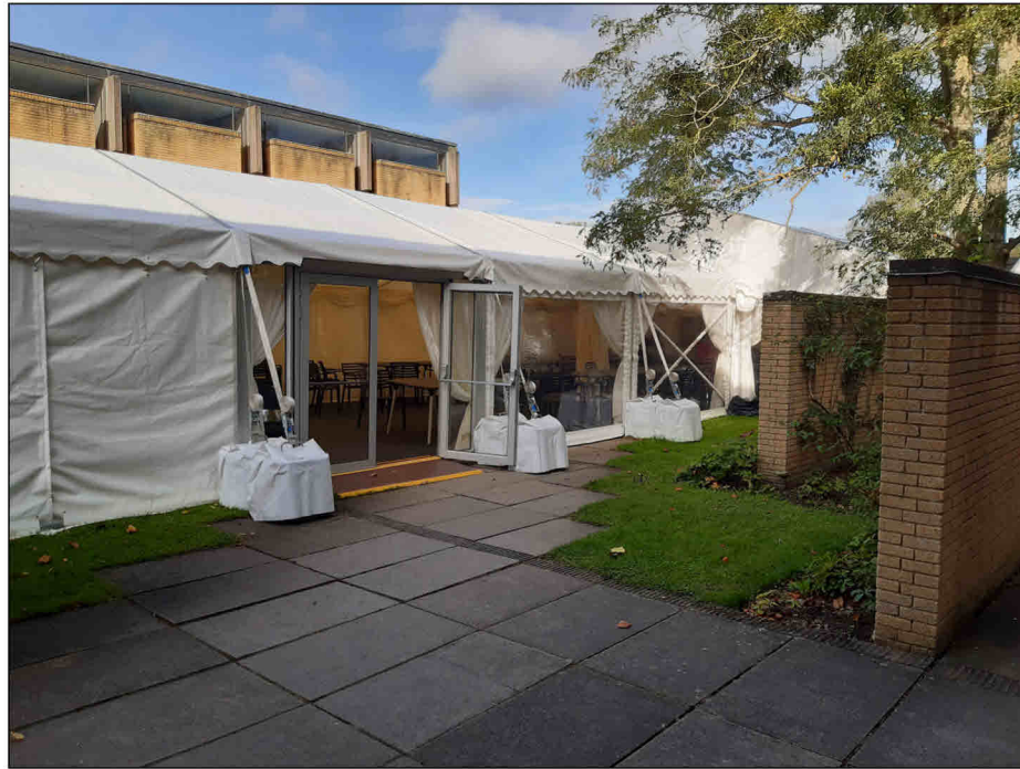
View 8 Looking north-west to marquee with Dining Hall behind