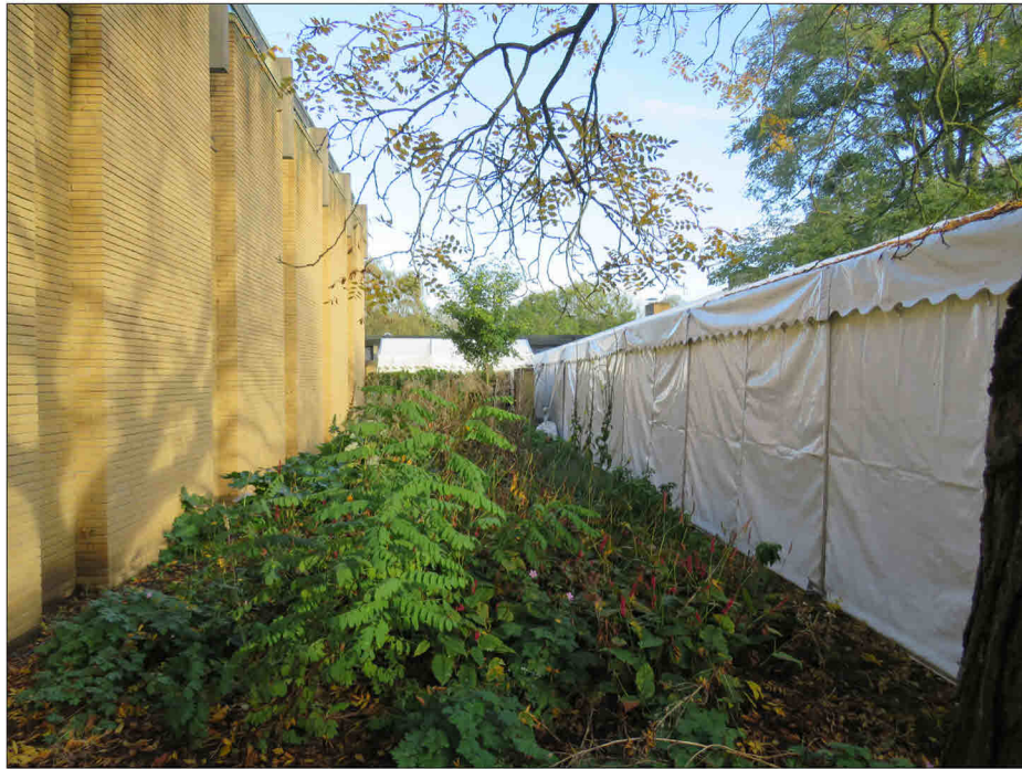
View 7 Looking between marquee & Dining Hall