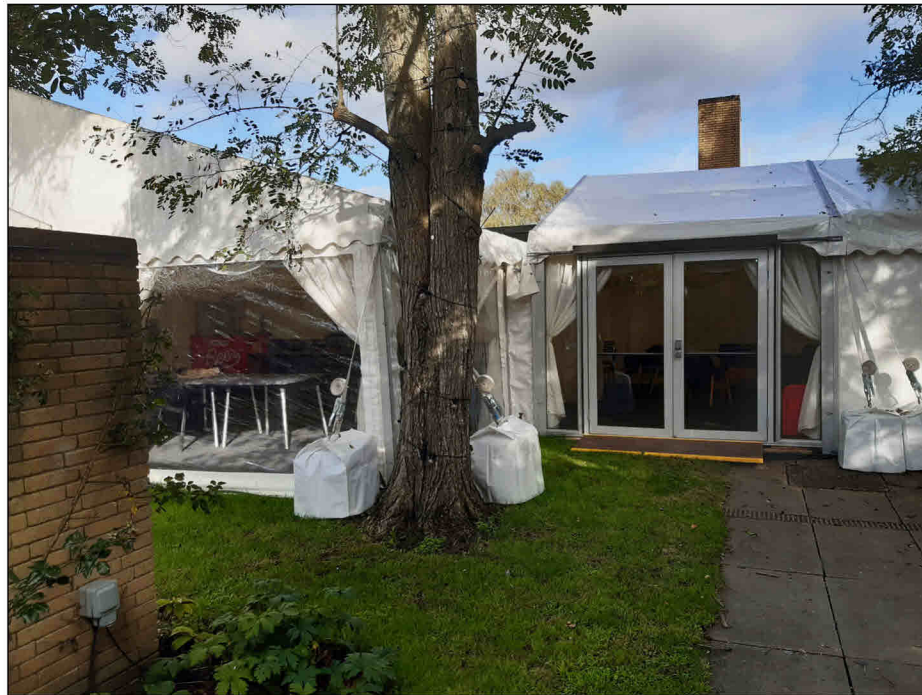
View 10 Looking north to marquee with JCR behind