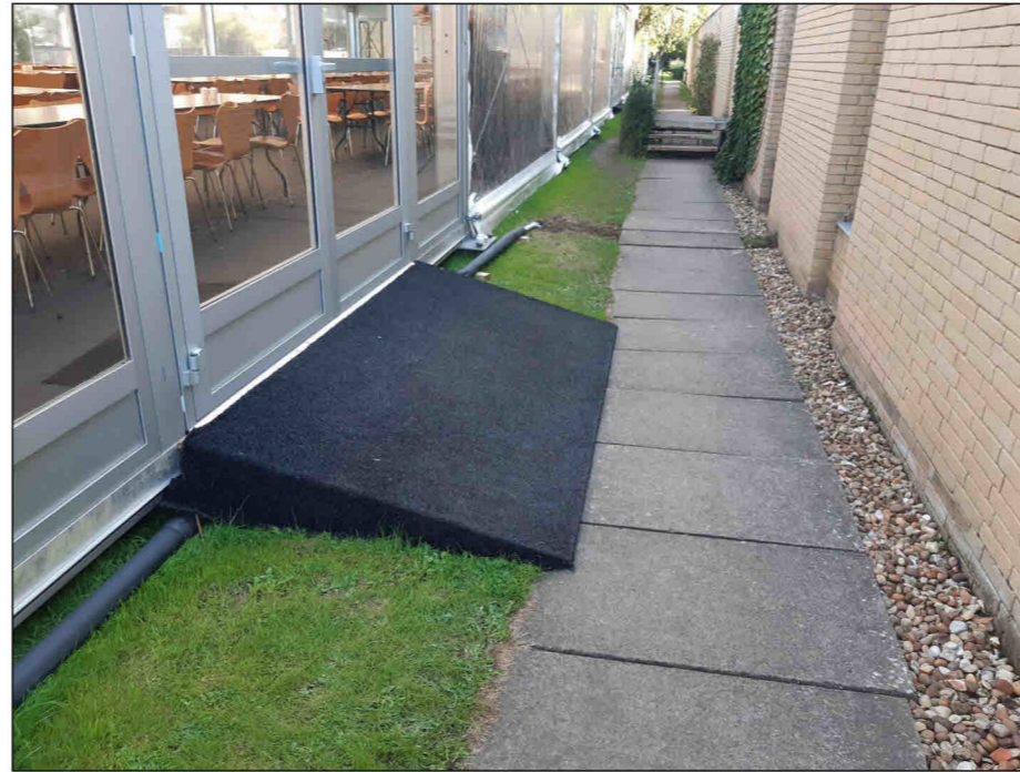
View 2 Looking south between marquee & Master's Lodgings