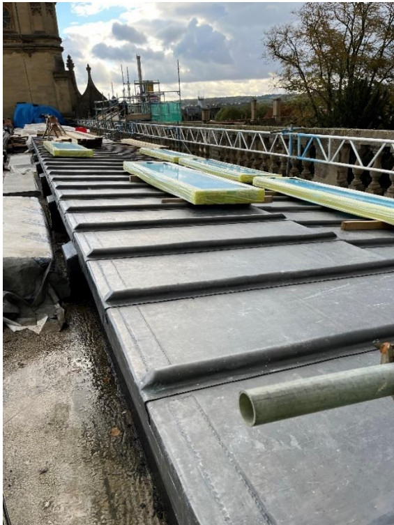
View of leadwork in works phase Summer 2023 to Tom Quad Staircase 5-7. Rooflights temporarily stored on lead roof are to be relocated.