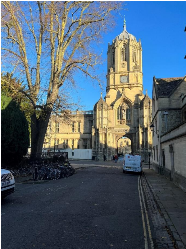
View of Tom Tower from Pembroke Square.