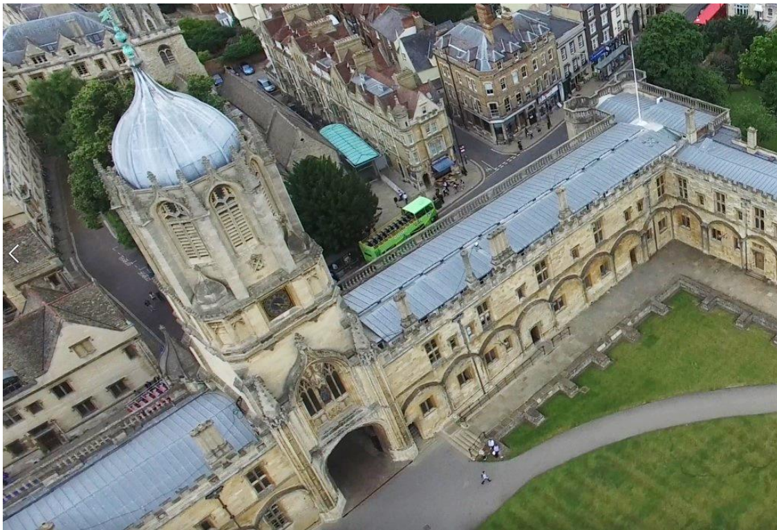
Aerial view of Tom Quad Staircase 5-7 roof, prior to re-roofing.