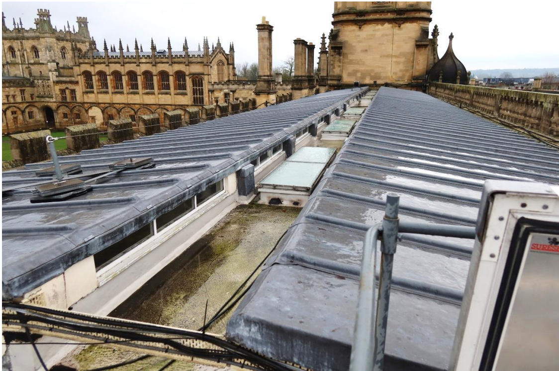
View of Tom Quad Staircase 5-7 roof from the North looking south, prior to re-roofing.