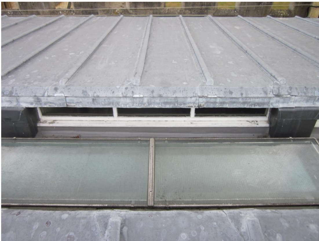
View of typical high-level central window and rooflight to Tom Quad Staircase 5-7. Note: High-level windows have been removed in the Summer 2023 works phase.