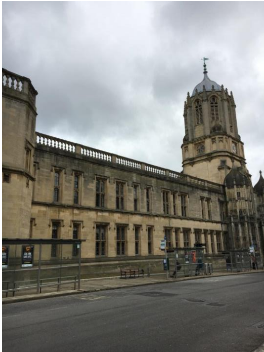
View of Tom Quad Staircase 5-7 from St Aldate's.