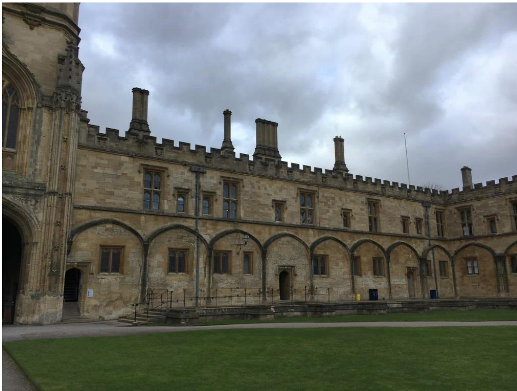
View of Tom Quad Staircase 5-7 from within the Quadrangle. (Tom Quad)