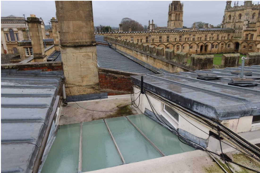
View of Tom Quad Staircase 5-7 roof from the North looking East.