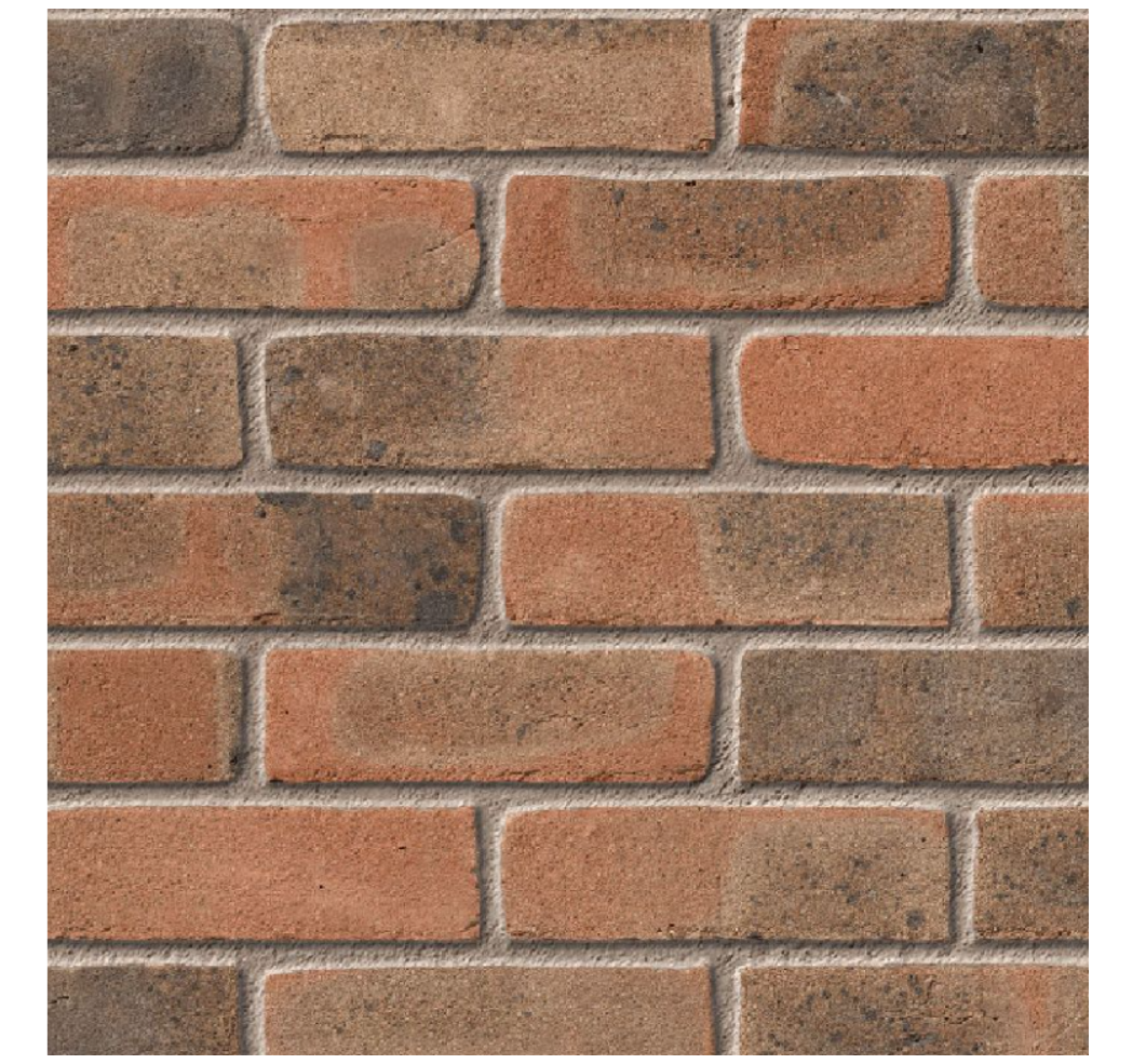
Ibstock Cottage Mixture Brown Brick