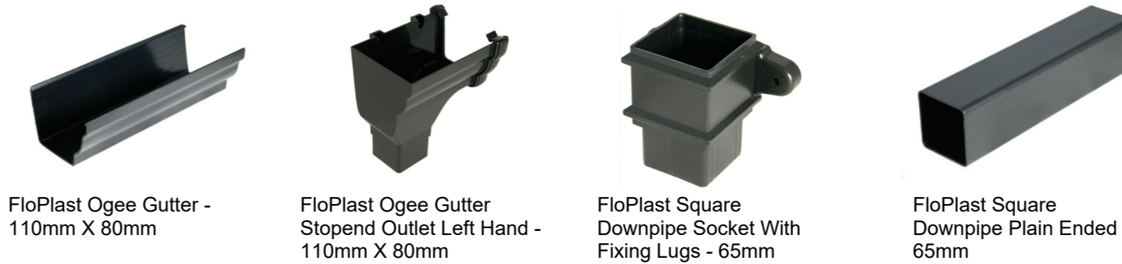
FloPlast Ogee Gutter - 110mm X 65mm FloPlast Ogee Gutter Sloped Outlet Left Hand - 110mm X 80mm FloPlast Square Downpipe Socket With Fixing Lugs - 65mm FloPlast Square Downpipe Plain Ended - 65mm

All Half Pipes and Down pipes in FloPlast - Cast Iron Effect