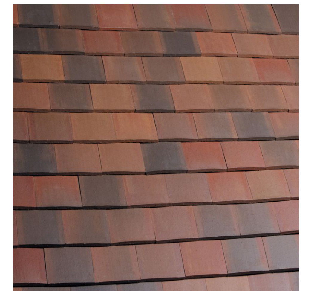
Marley Acme Double Camber Clay Plain Roof Tile Smooth Brindle