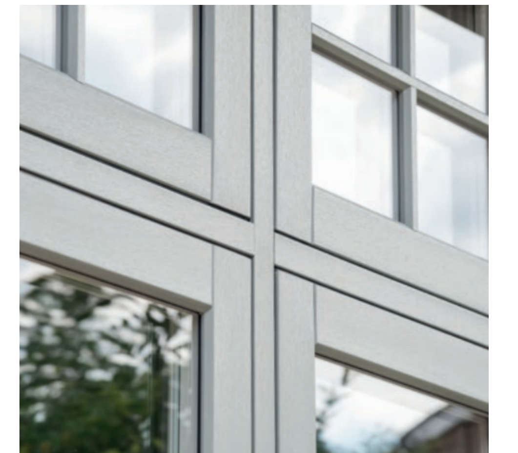
Flush: Traditional aesthetics without traditional pitfalls. PVC Timber looking windows, grain finish in white.