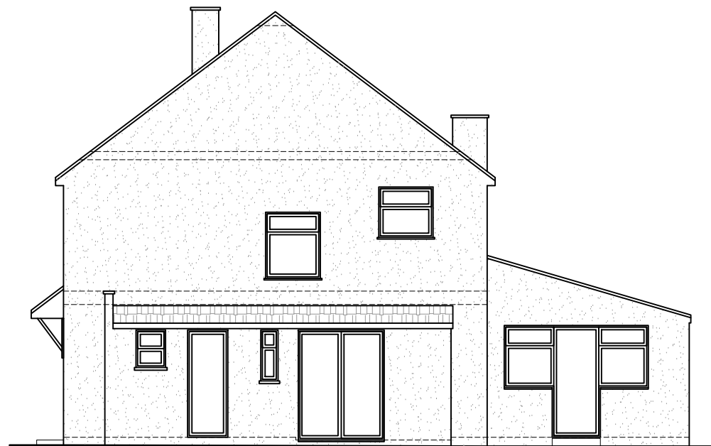
EXISTING RIGHT SIDE ELEVATION