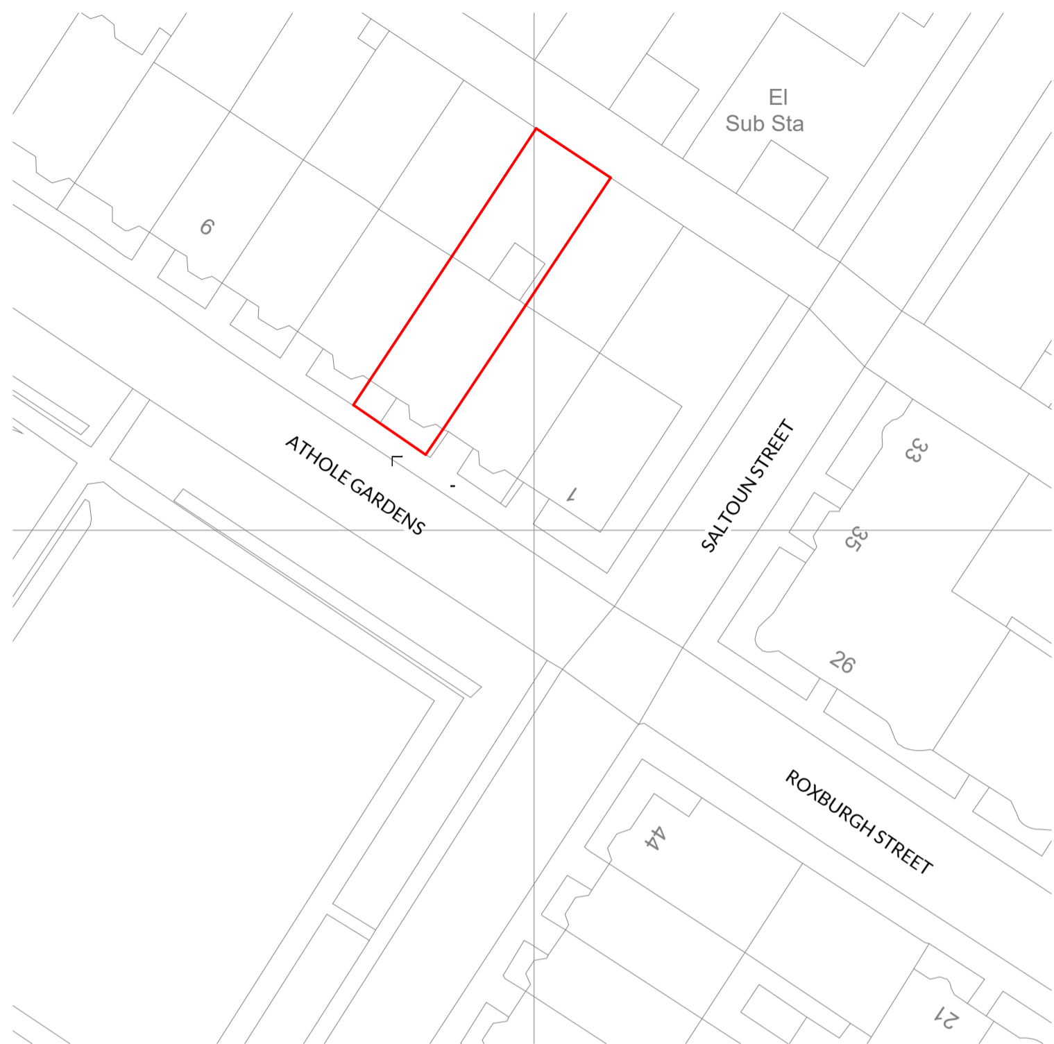
1 SITE PLAN - AS EXISTING 1:500