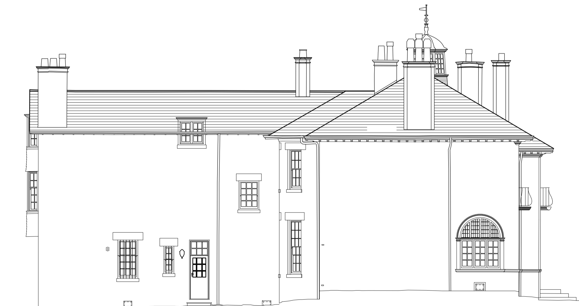
EXISTING SIDE (WEST-FACING) ELEVATION // 1:100