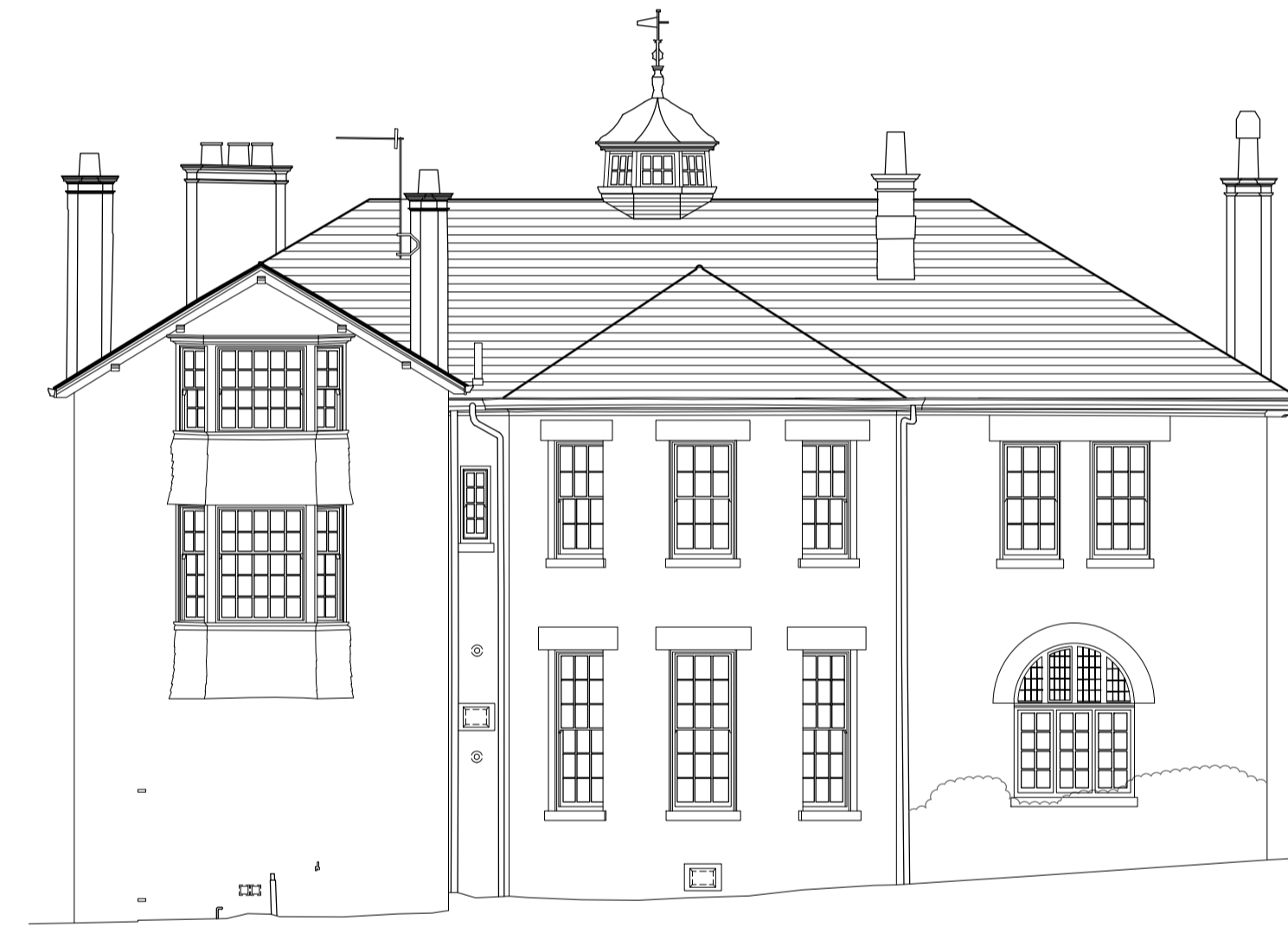
EXISTING REAR (NORTH-FACING) ELEVATION // 1:100