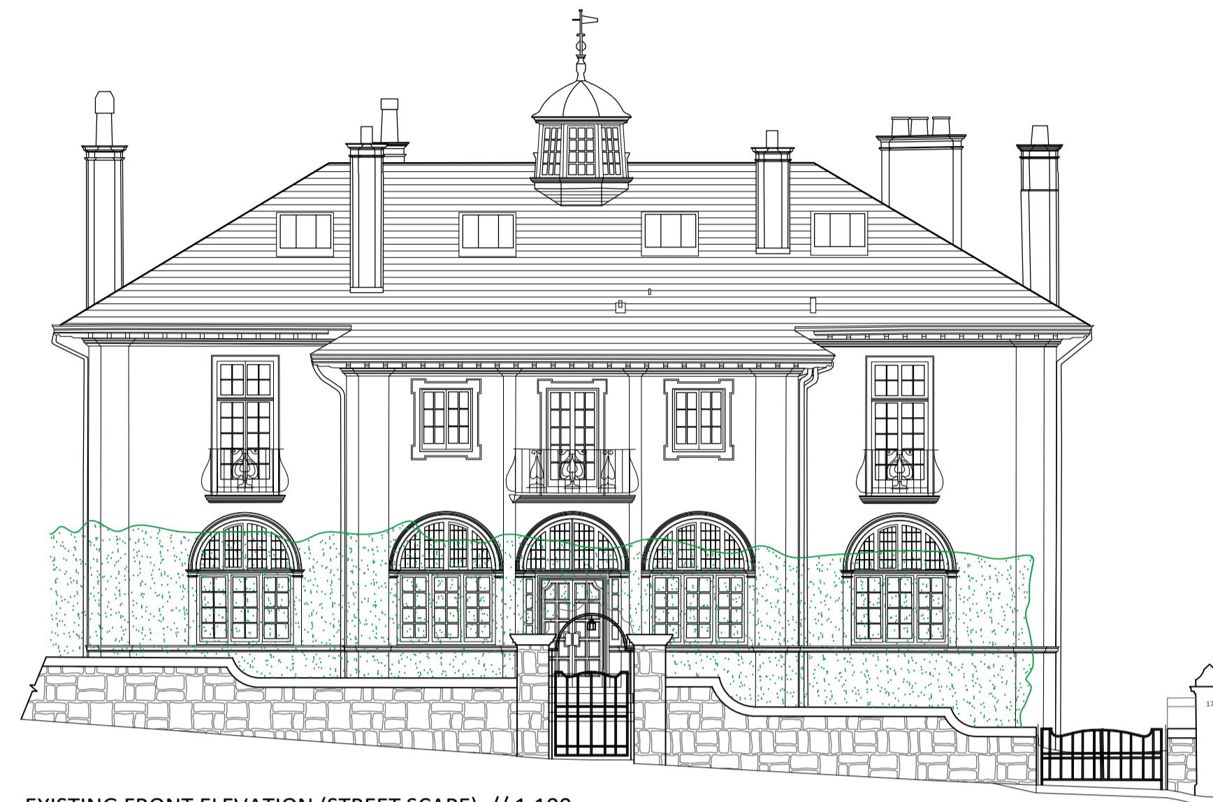
EXISTING FRONT ELEVATION (STREET SCAPE) // 1:100