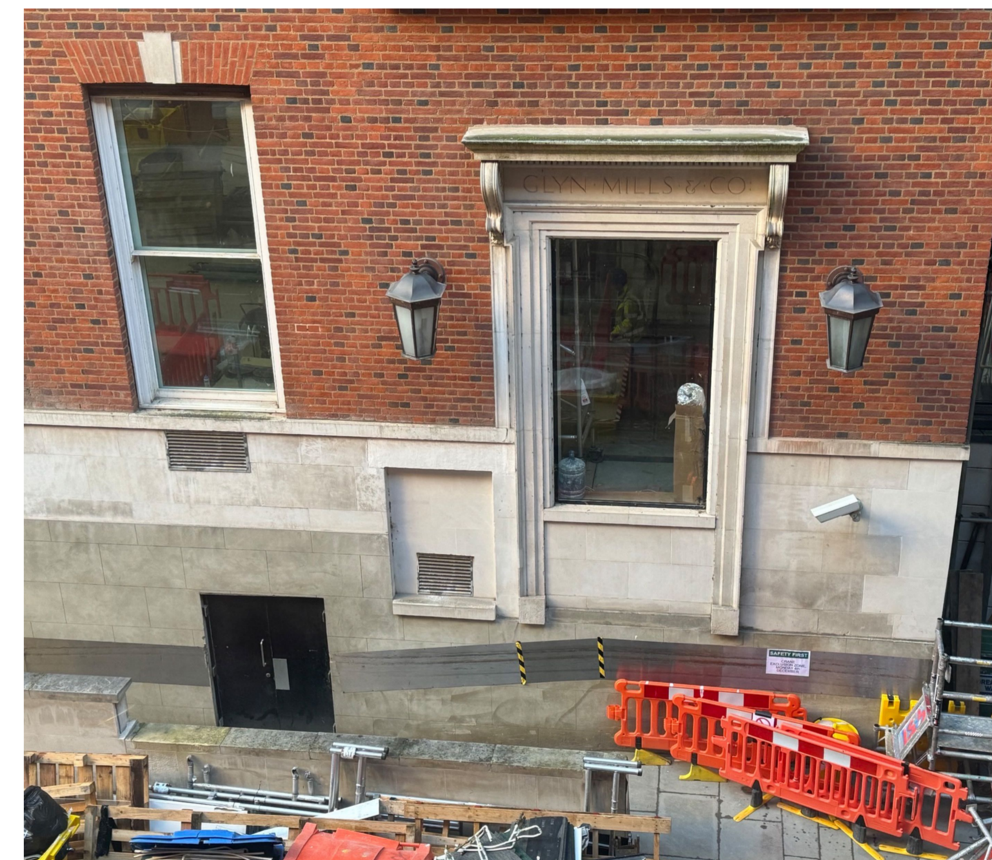
Proposed Vent Location