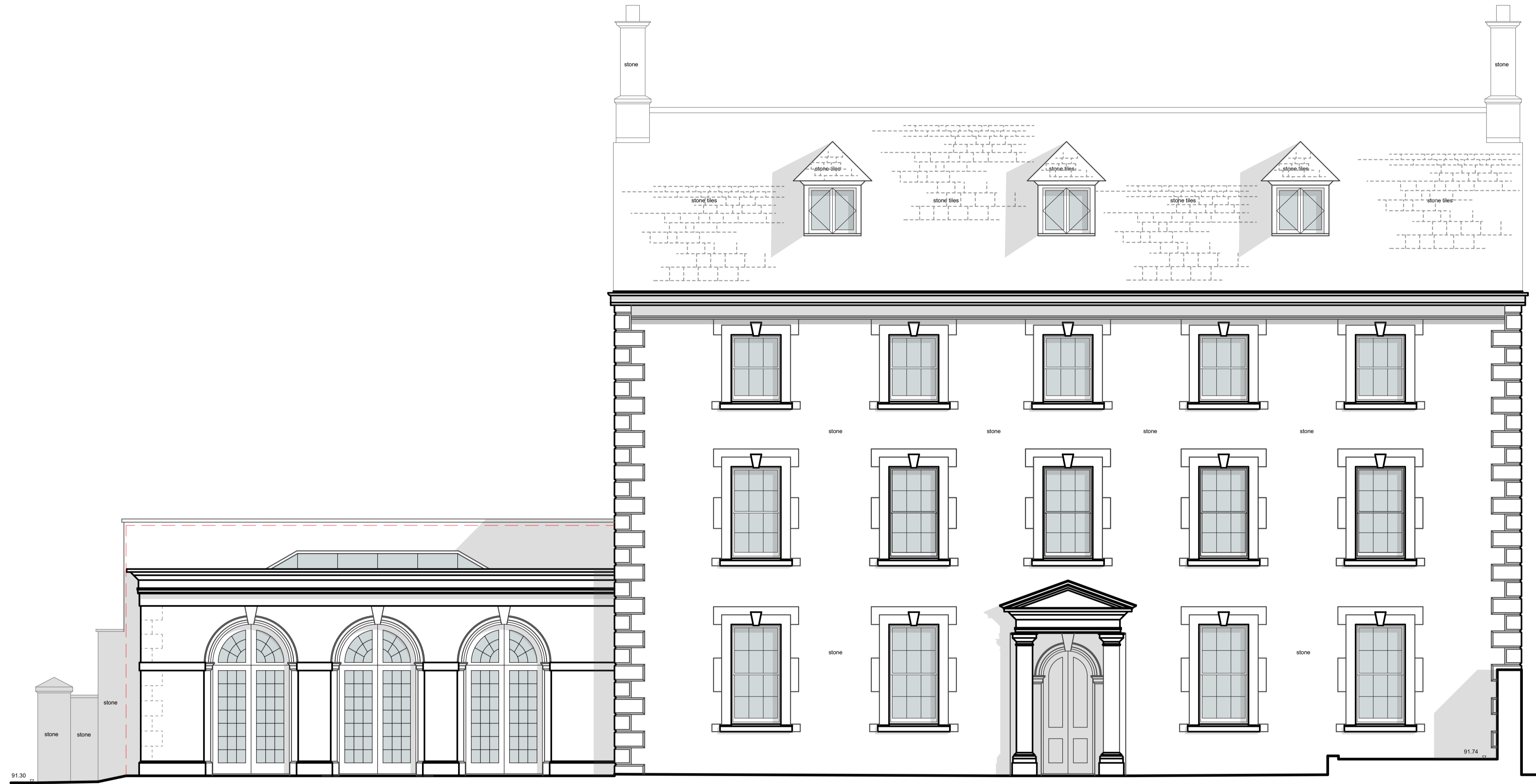
Existing South Elevation Scale: 1:50

Note No alterations are proposed to the North and East Elevations as part of this application