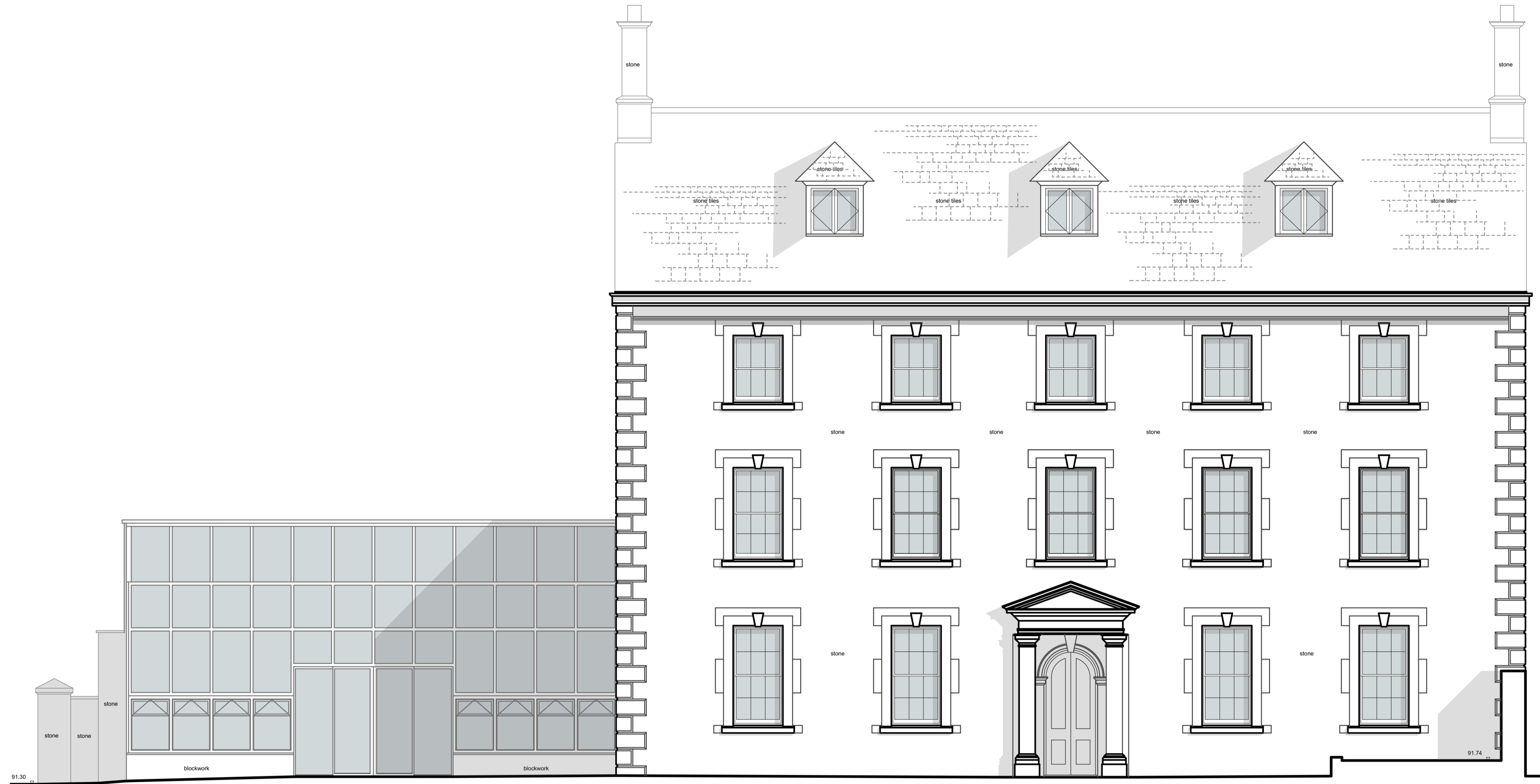
Existing South Elevation Scale: 1:50

Note No alterations are proposed to the North and East Elevations as part of this application