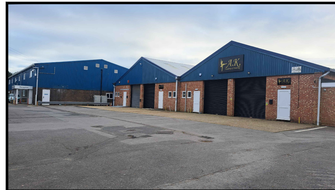
Viewpoint 1 - showing Unit 4 in relation to Units 1 to 3 on the right hand side.