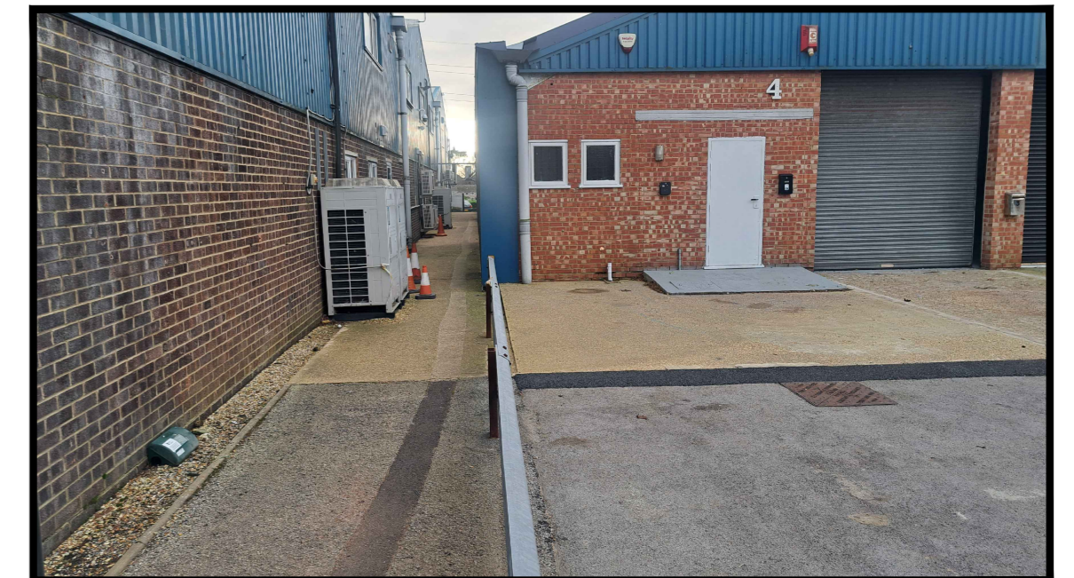
Viewpoint 2 - showing pedestrian alley adjacent to Unit 4 and Unit 4 frontage - to be refurbished similar to Units 1 to 3