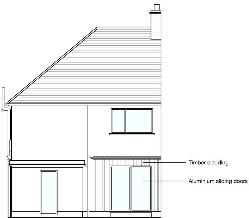
Existing Rear (South) Elevation scale 1:100