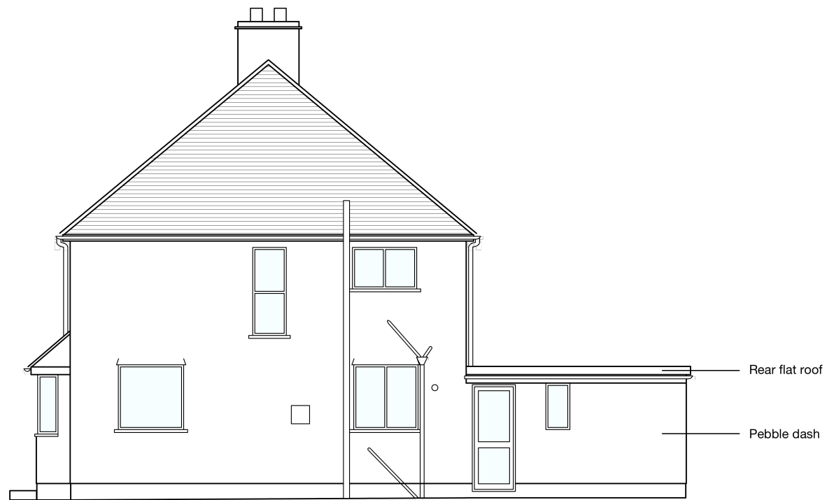
Existing Side (West) Elevation scale 1:100