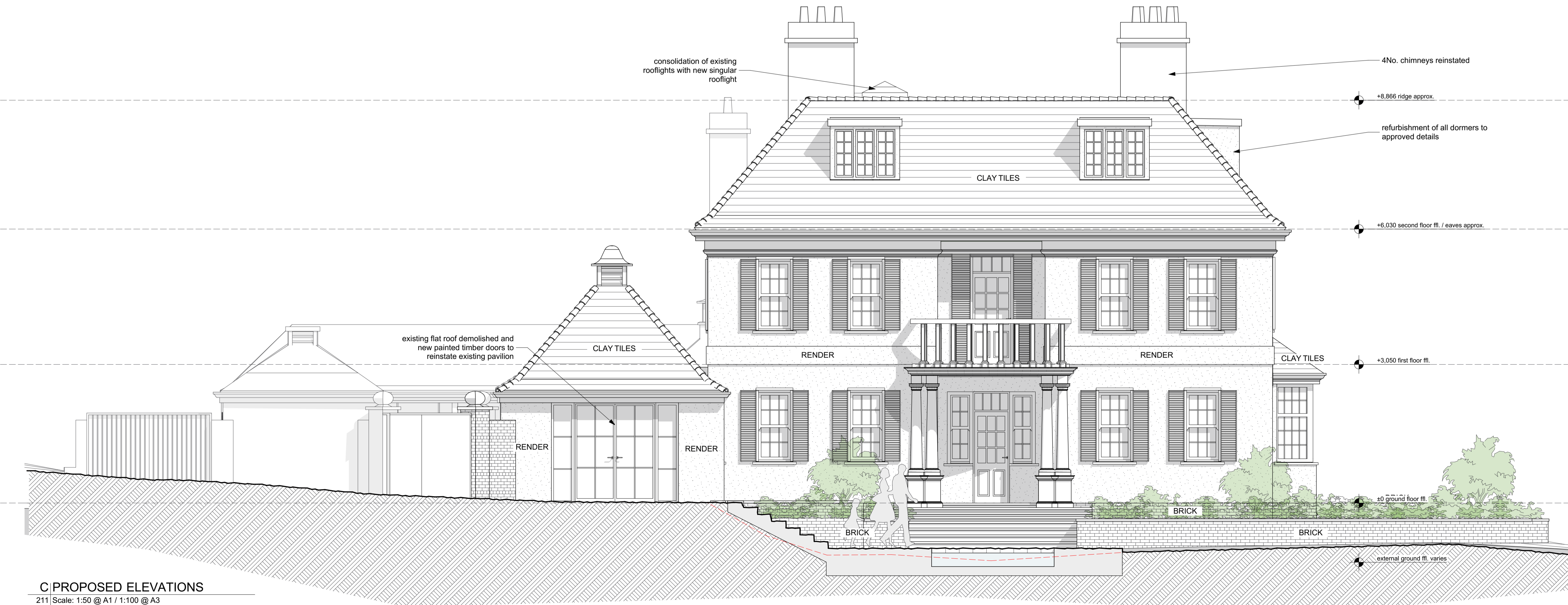
C PROPOSED ELEVATIONS 211 | Scale: 1:50 @ A1 / 1:100 @ A3