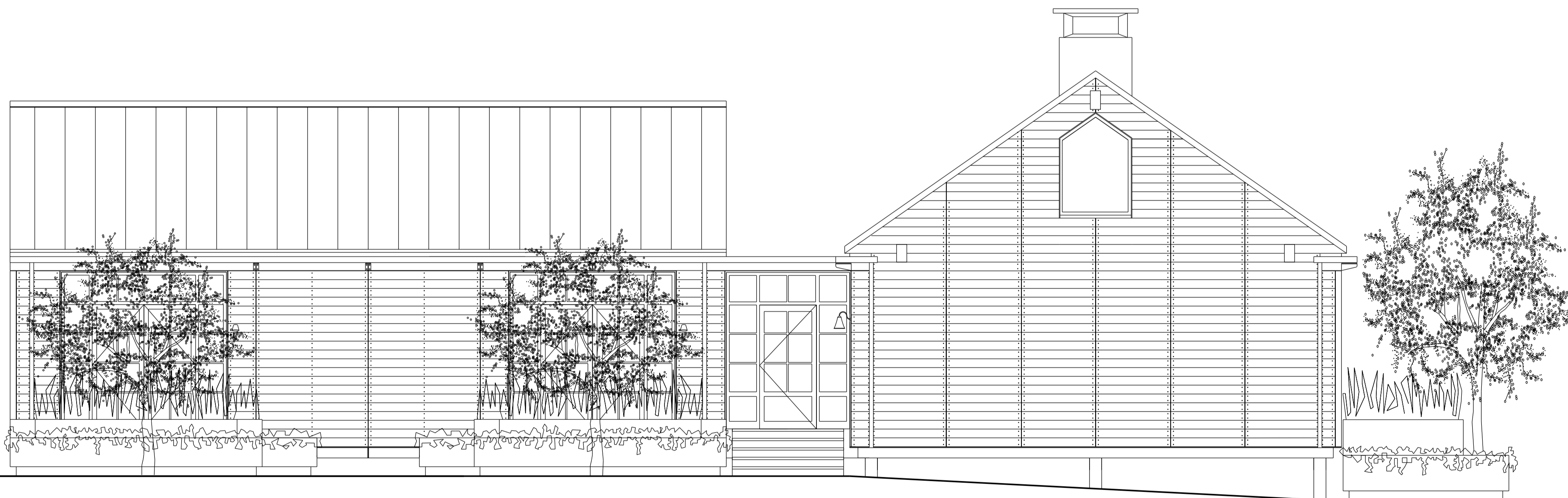
South East Elevation (with planters and access decks)