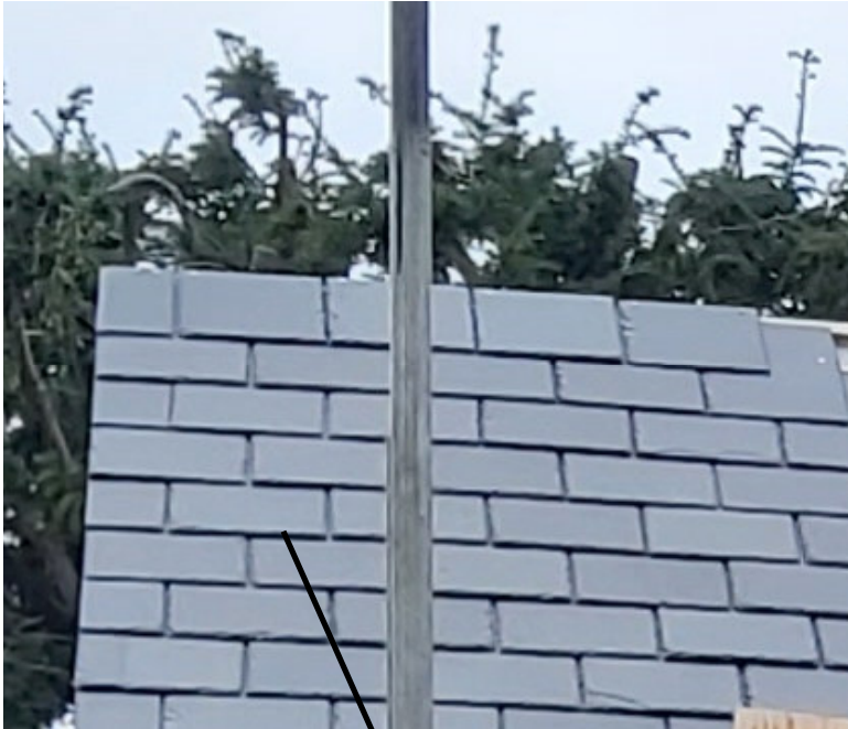
Natural Slate Roofing