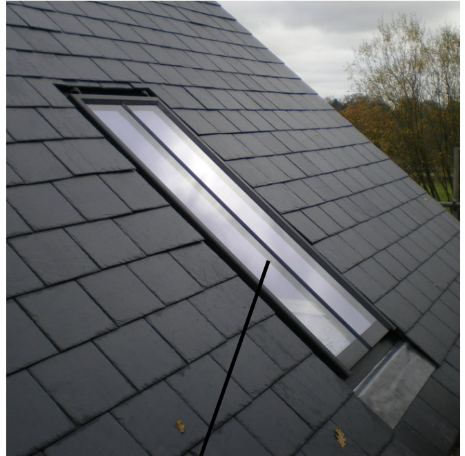
Clement Conservation Rooflight