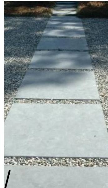
Footpath Stone Paving