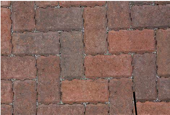
Permeable Blockwork Paving

The rear paved area is to be remodelled with porcelain slate paving. Paving is shown extended to the existing Cottage entrance, Paving with gravel edging is shown to outbuildings and Cottage perimeter..