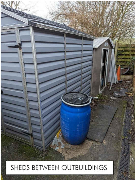
SHEDS BETWEEN OUTBUILDINGS