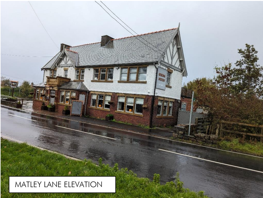
MATLEY LANE ELEVATION