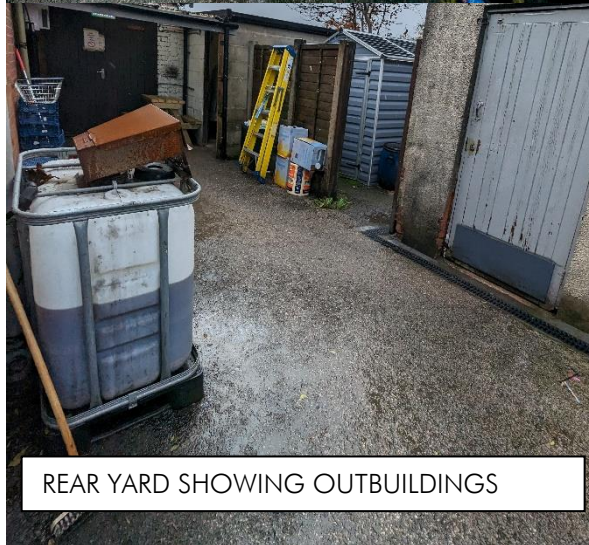
REAR YARD SHOWING OUTBUILDINGS