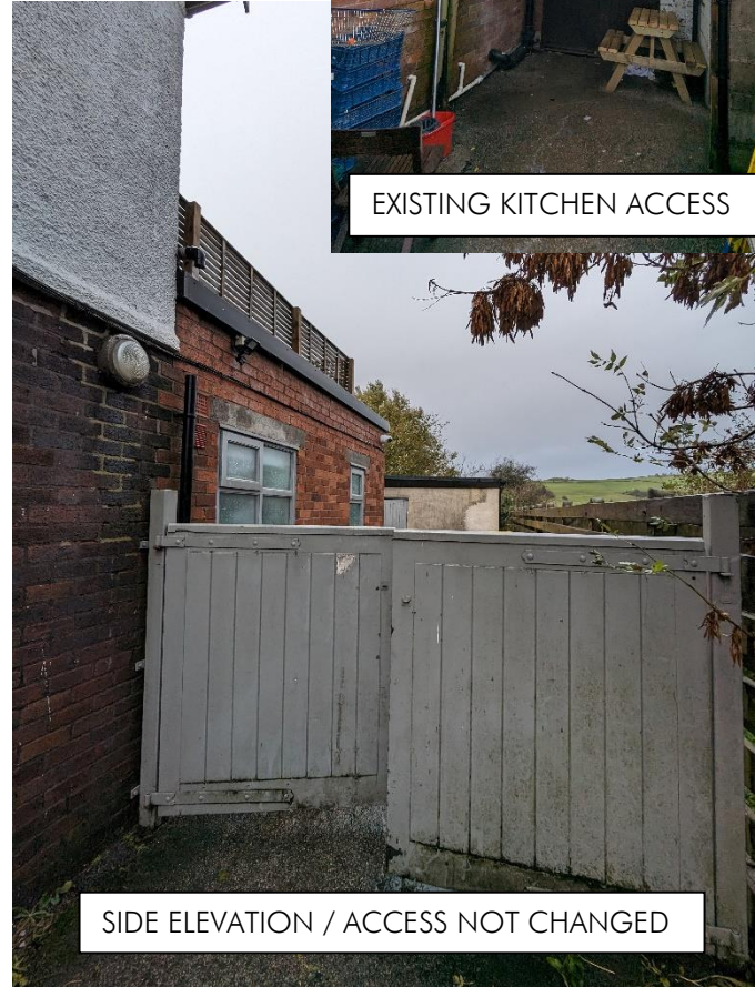
SIDE ELEVATION / ACCESS NOT CHANGED