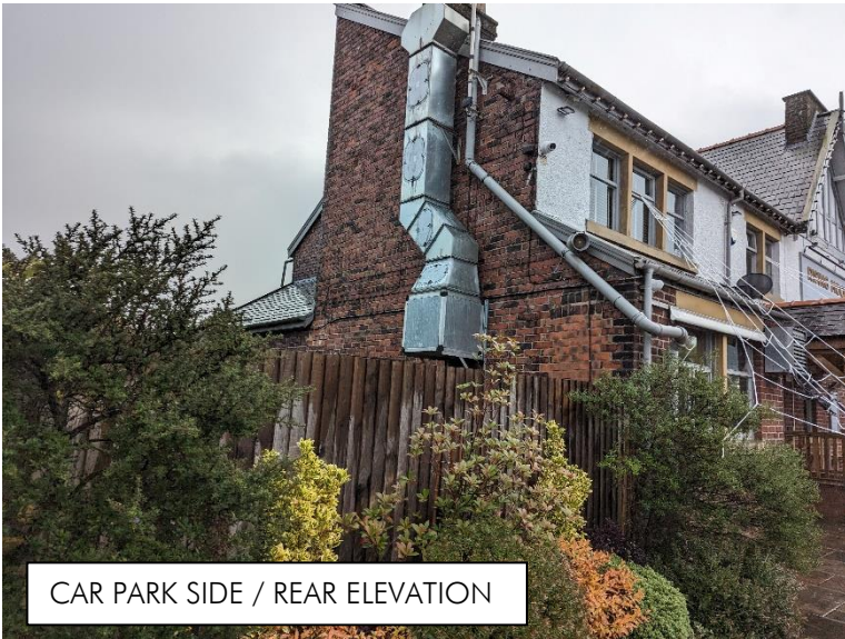
CAR PARK SIDE / REAR ELEVATION