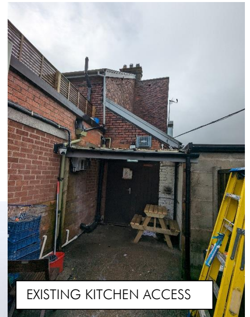
EXISTING KITCHEN ACCESS