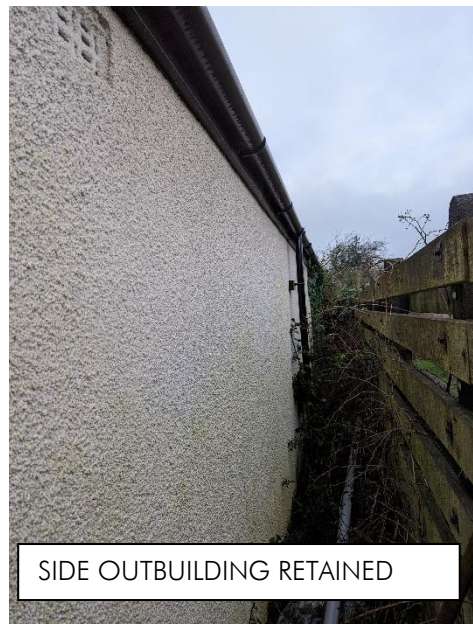
SIDE OUTBUILDING RETAINED