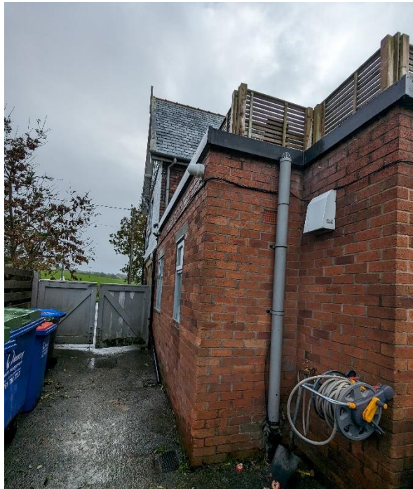
SIDE ELEVATION / ACCESS NOT CHANGED