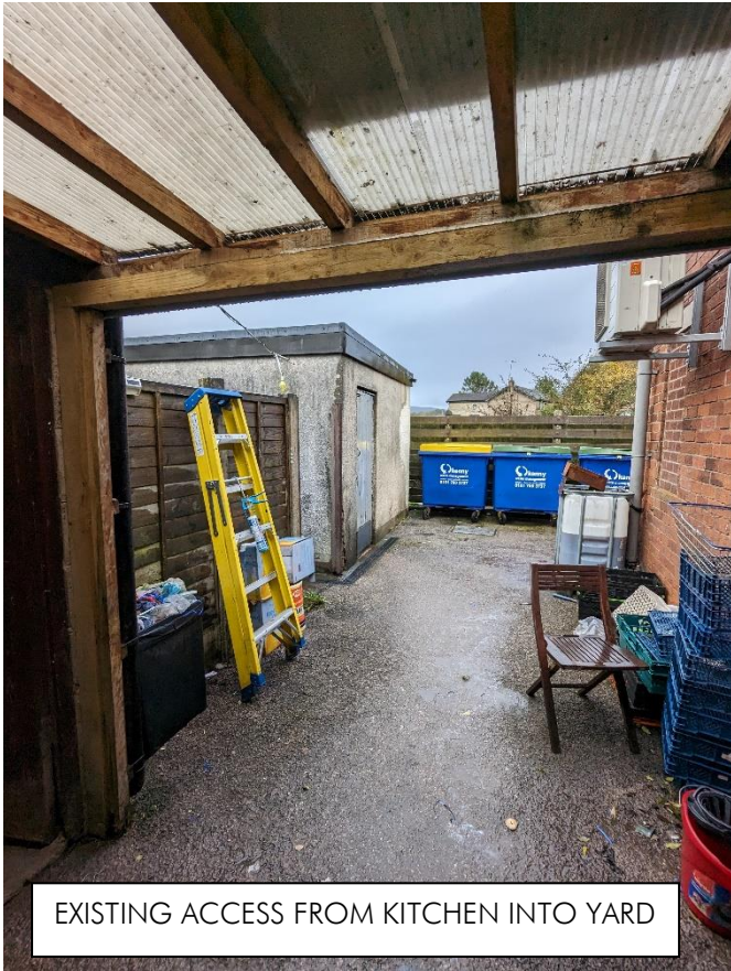
EXISTING ACCESS FROM KITCHEN INTO YARD