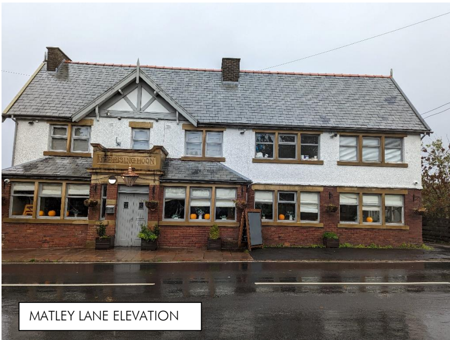
MATLEY LANE ELEVATION