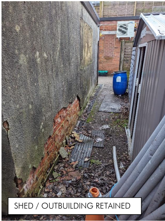
SHED / OUTBUILDING RETAINED