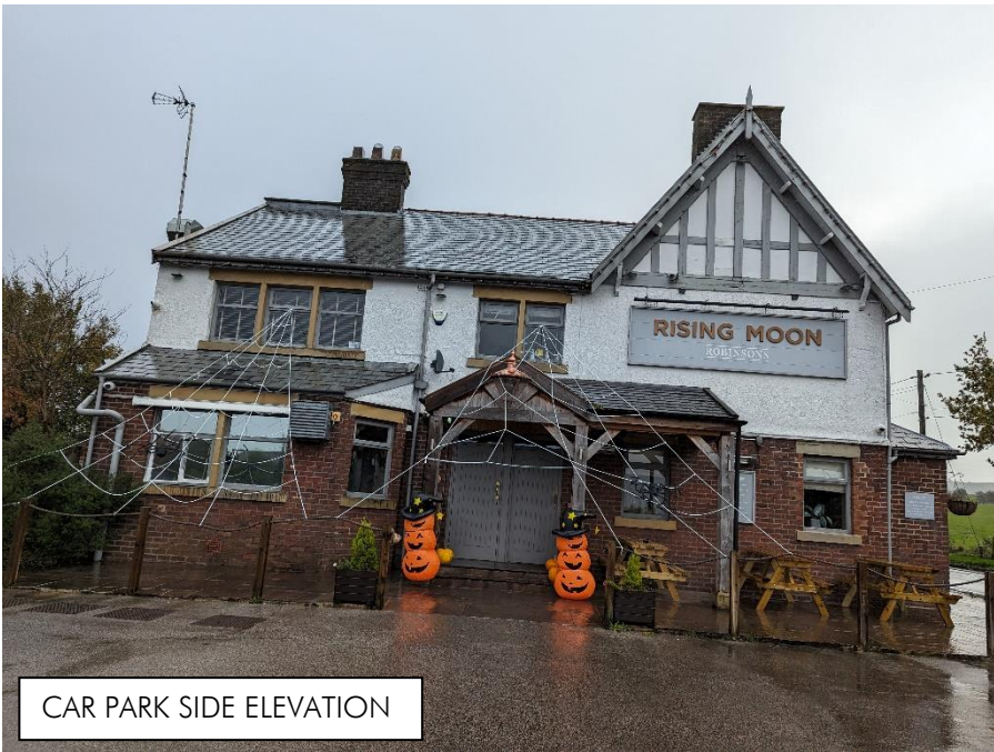
CAR PARK SIDE ELEVATION