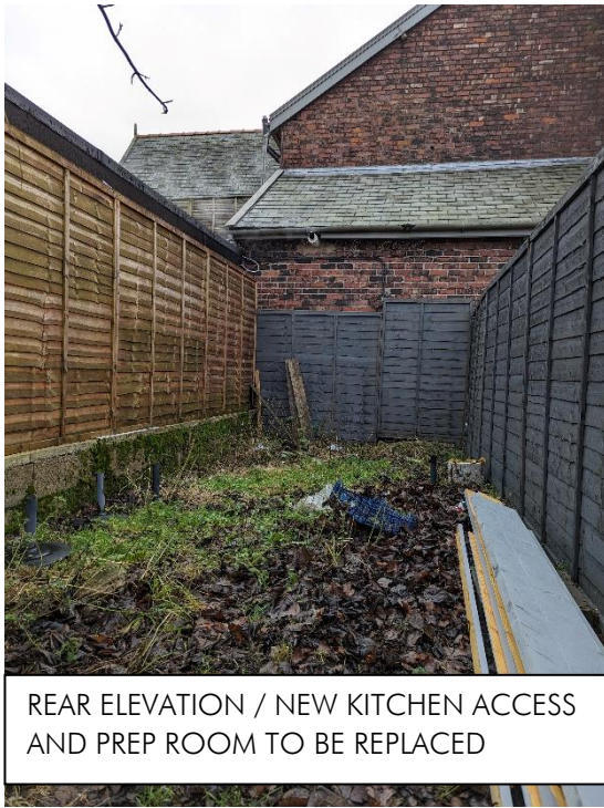
REAR ELEVATION / NEW KITCHEN ACCESS AND PREP ROOM TO BE REPLACED