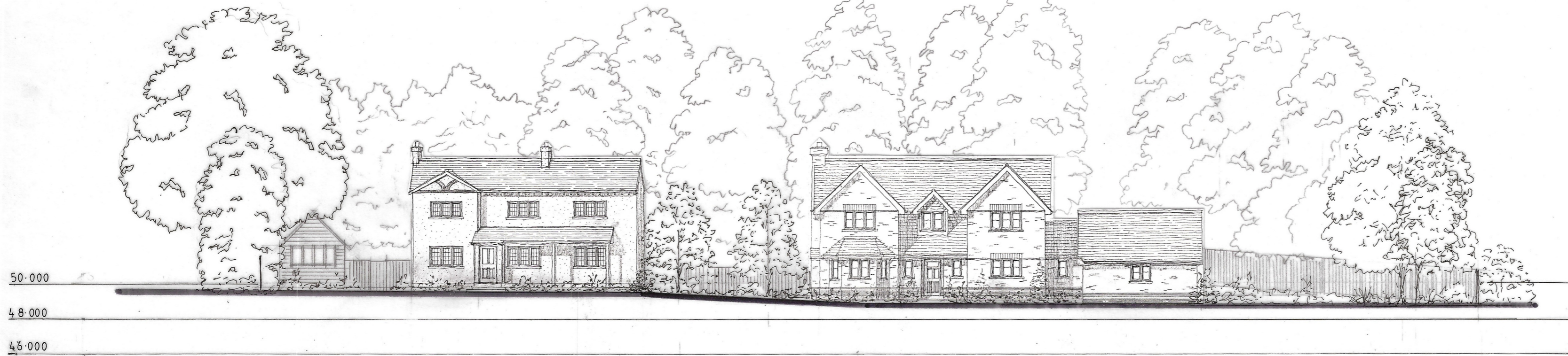
SITE SECTION-STREET SCENE