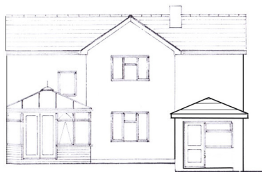
REAR ELEVATION - W