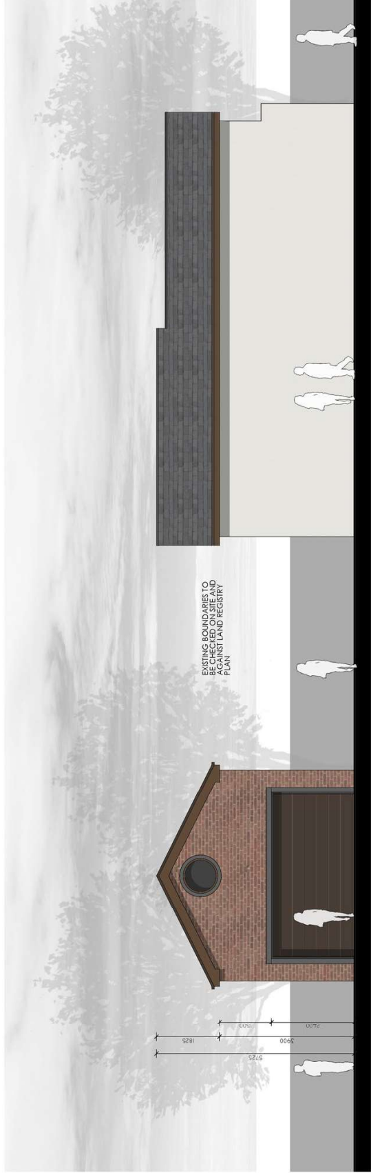
PROPOSED FRONT ELEVATION [1:50 at A1 or 1:100 at A3]