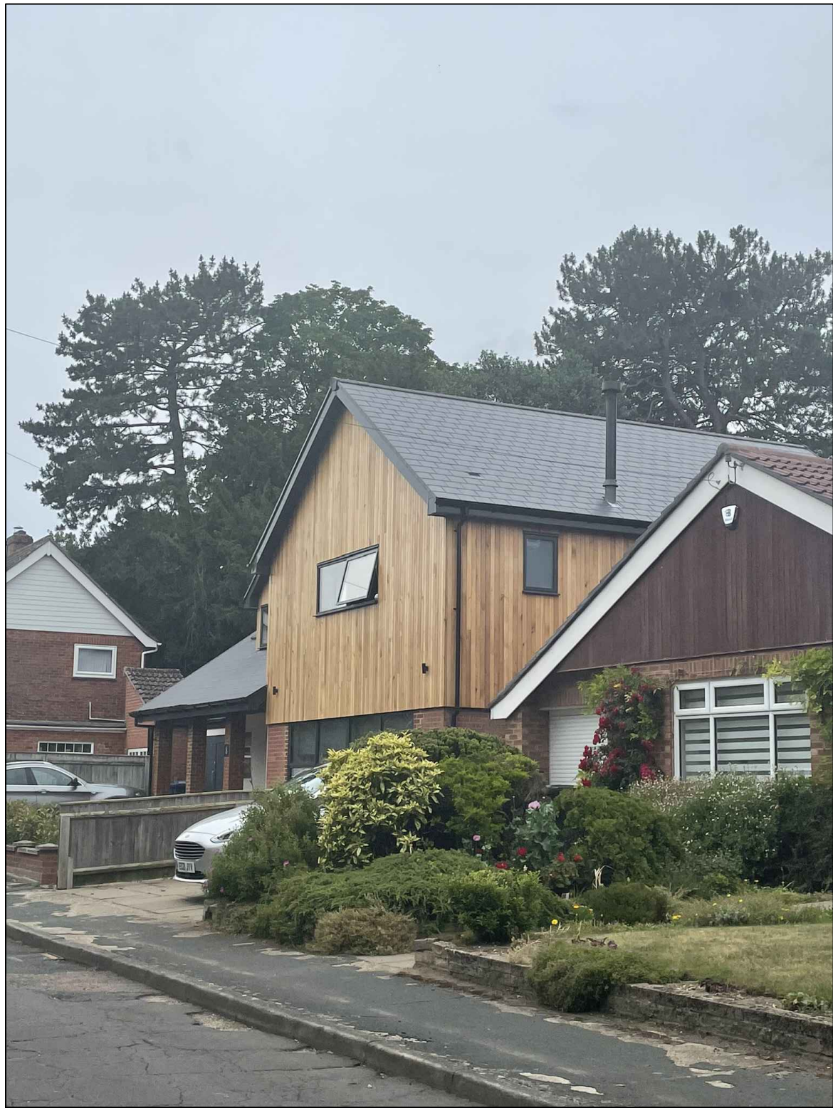
VIEW 01 - No. 6 Elms Avenue - Timber and Brick

No. 8 Elms Avenue was granted Planning Permission, Ref S/3316/19/FL, to add a First Floor to an existing bungalow. The extension was clad extensively in Western Red Cedar fixed vertically and although located in a prominent location on Elms Avenue, the officer's report stated that the proposal "is not considered to result in significant harm to the character and appearance of the area" and as such was considered to be in accordance with Policy H/Q1 of the Local Plan. No mention was made of the use of Cedar Cladding in such a prominent location.