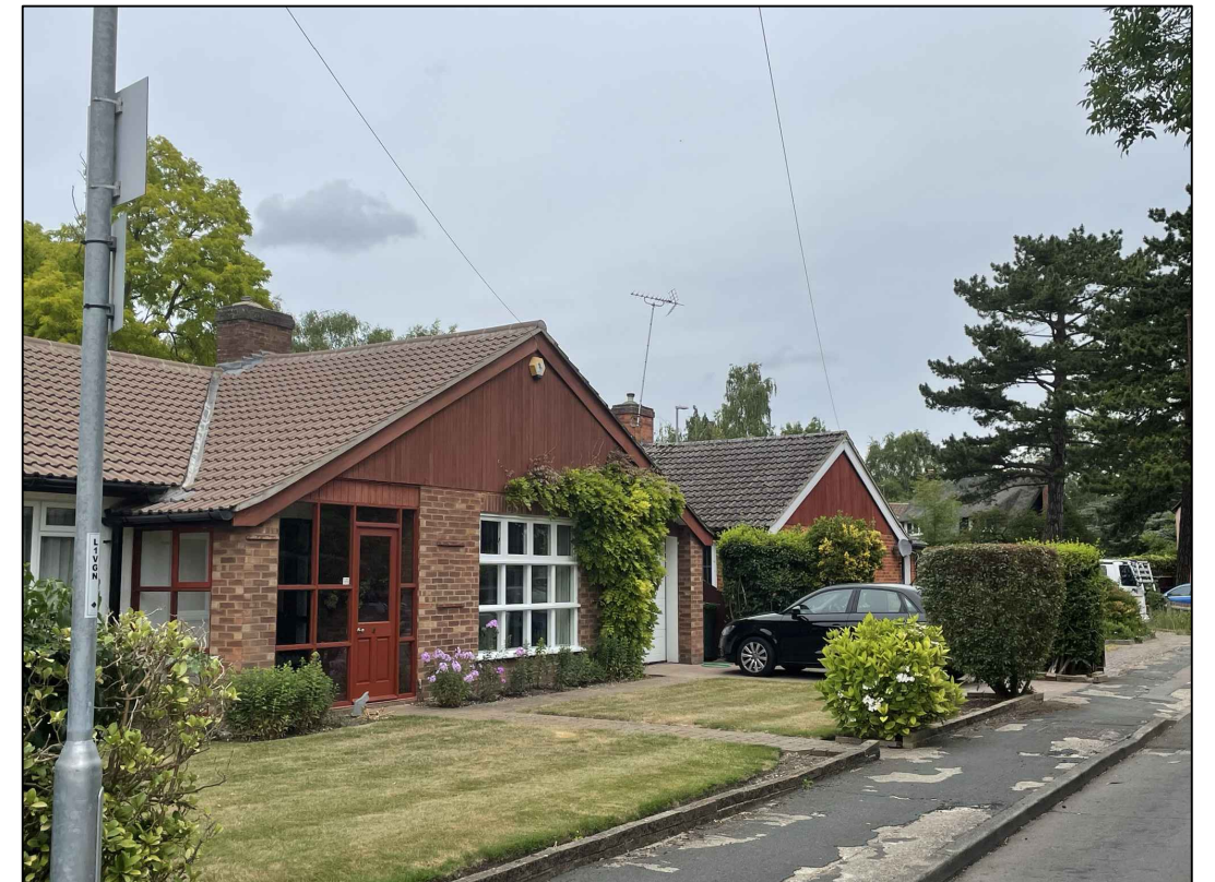
VIEW 03 - No. 2 and 4 Elms Avenue - Timber and Brick