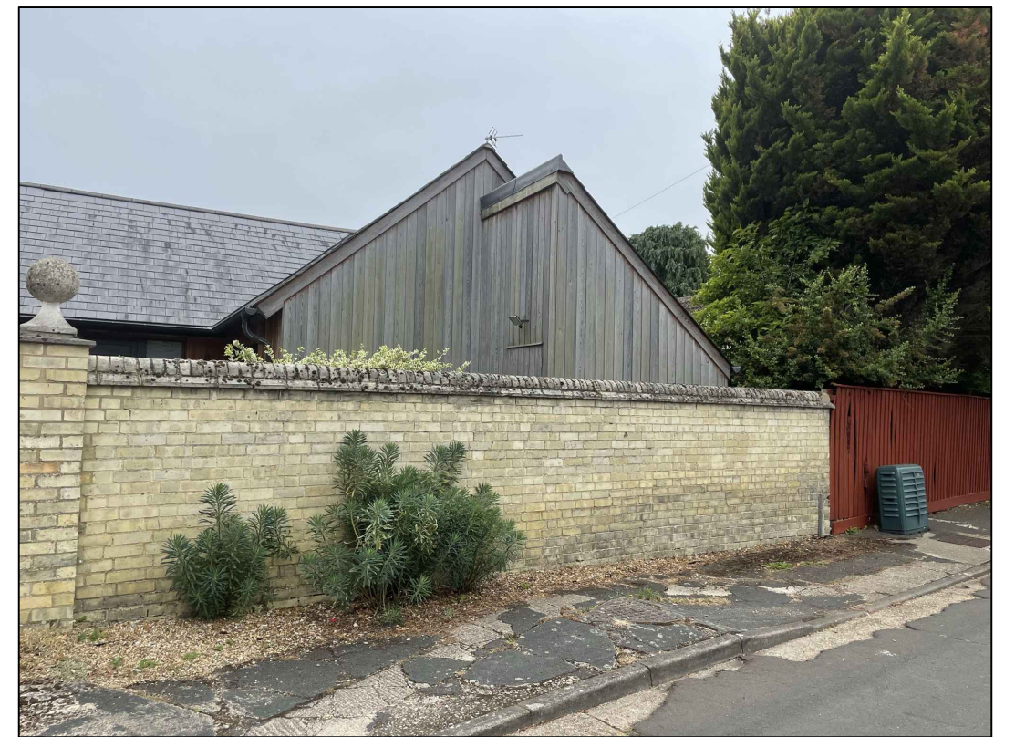
VIEW 04 - No. 1A Elms Avenue - Timber Cladding

The extension to No. 14 Elms Avenue draws on this palette of materials with the predominant material being Western Red Cedar cladding to differentiate between new and existing. This follows the precedent set by the extension of No. 8 Elms Avenue. It should be noted that No. 14 is located at the far end of Elms Avenue and is significantly less prominent in the street scene than No. 8