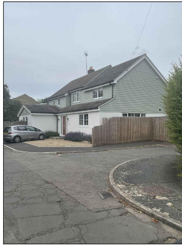
VIEW 02 - 16 Elms Avenue - Fibre cement cladding and Render

The Officer's Report also stated that the scale of the addition was considered "an appropriate development in terms of the general scale and character" of the area and that it "would not appear dominant in the street scene"