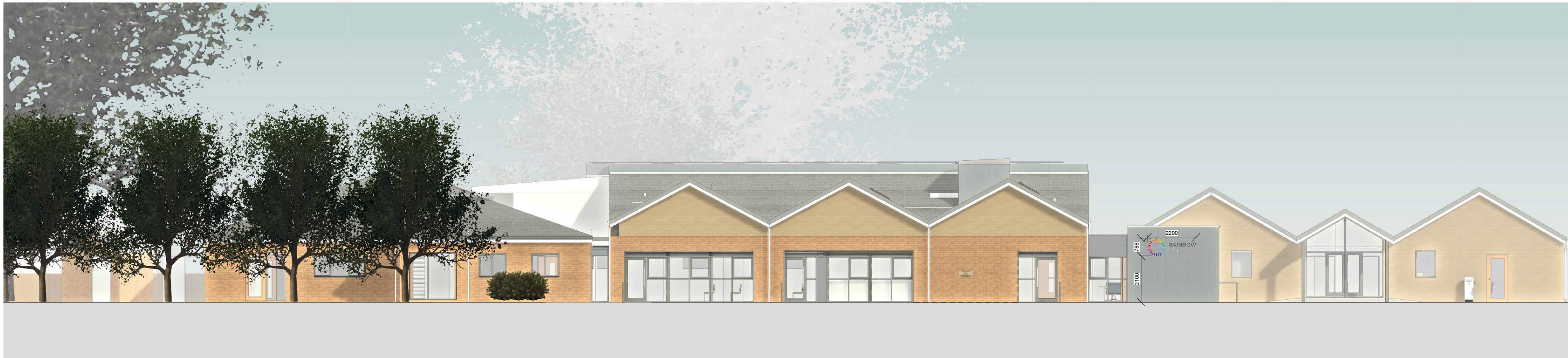
Front Elevation Showing New Signage