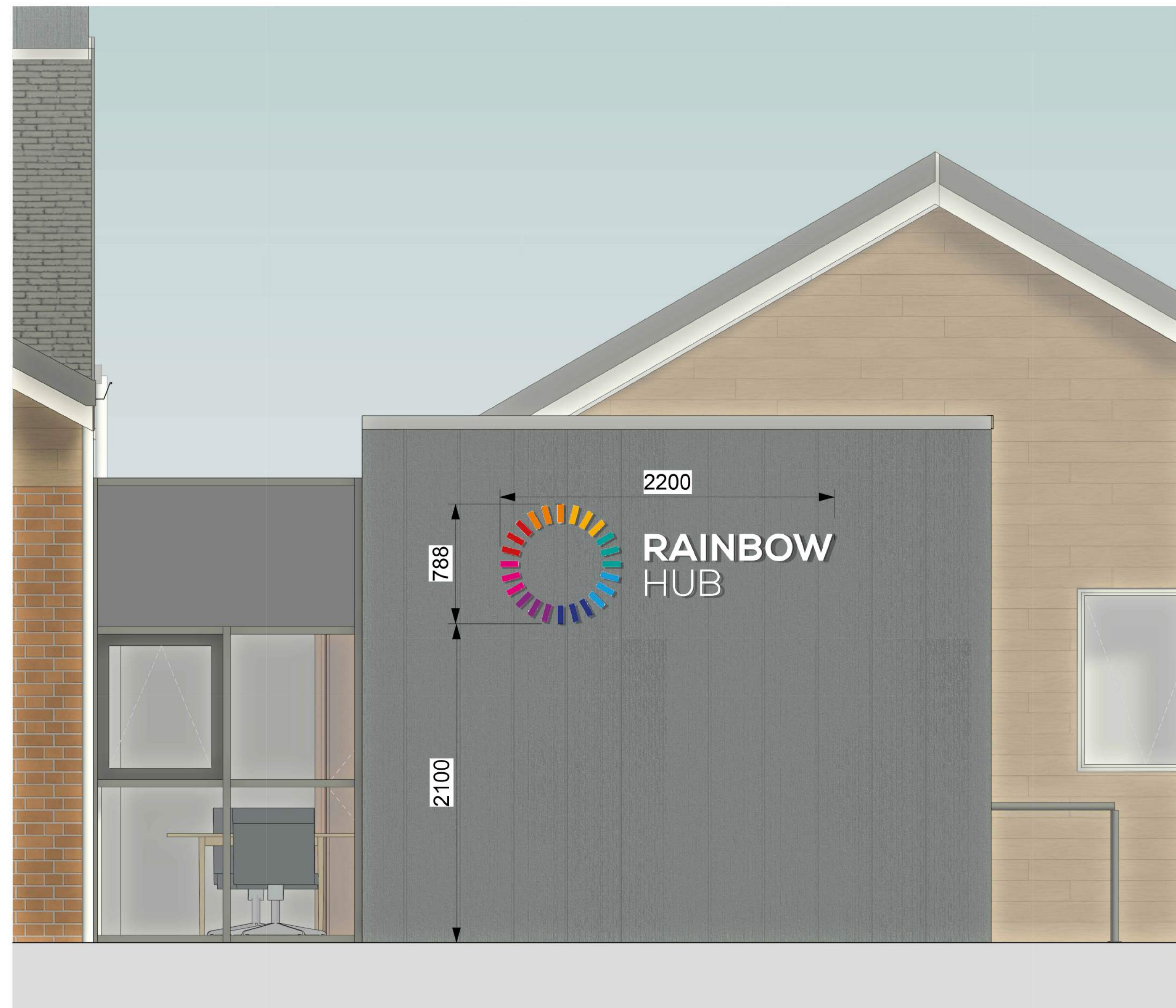
Front Elevation Showing New Signage Copy 1