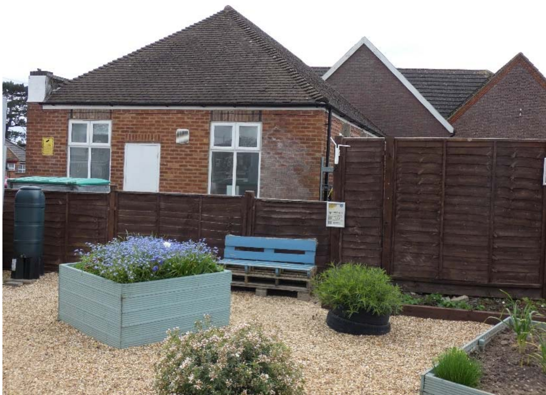
Garden currently separated from Janes Hall building