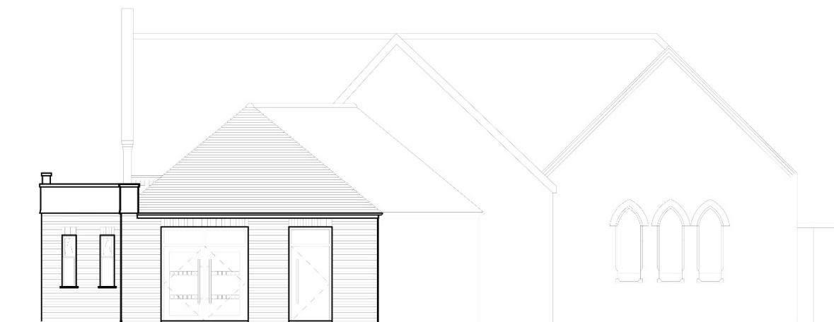
EAST ELEVATION AS PROPOSED