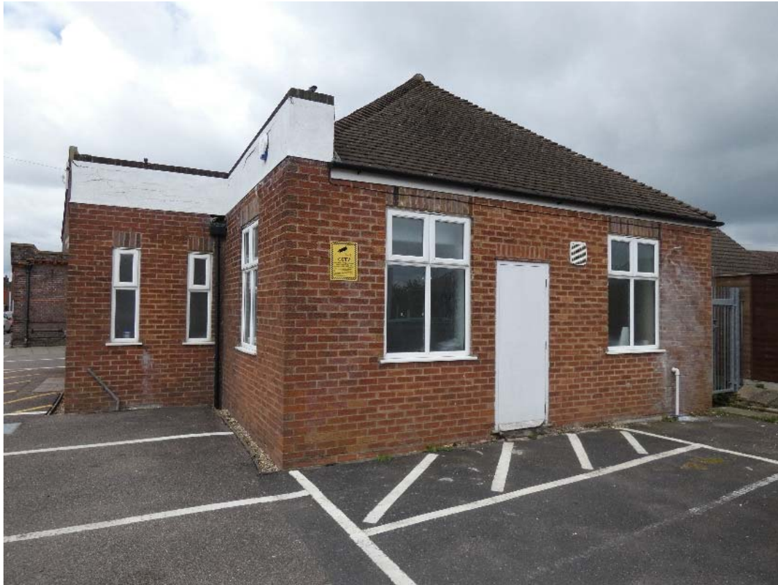
Janes Hall building east elevation area for proposed link to Community Garden