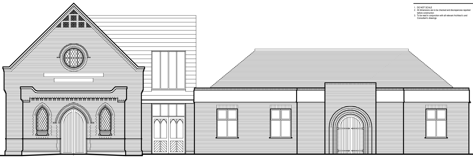
SOUTH ELEVATION AS EXISTING