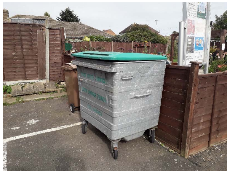
Existing bins stored between Janes Hall building and Community Garden