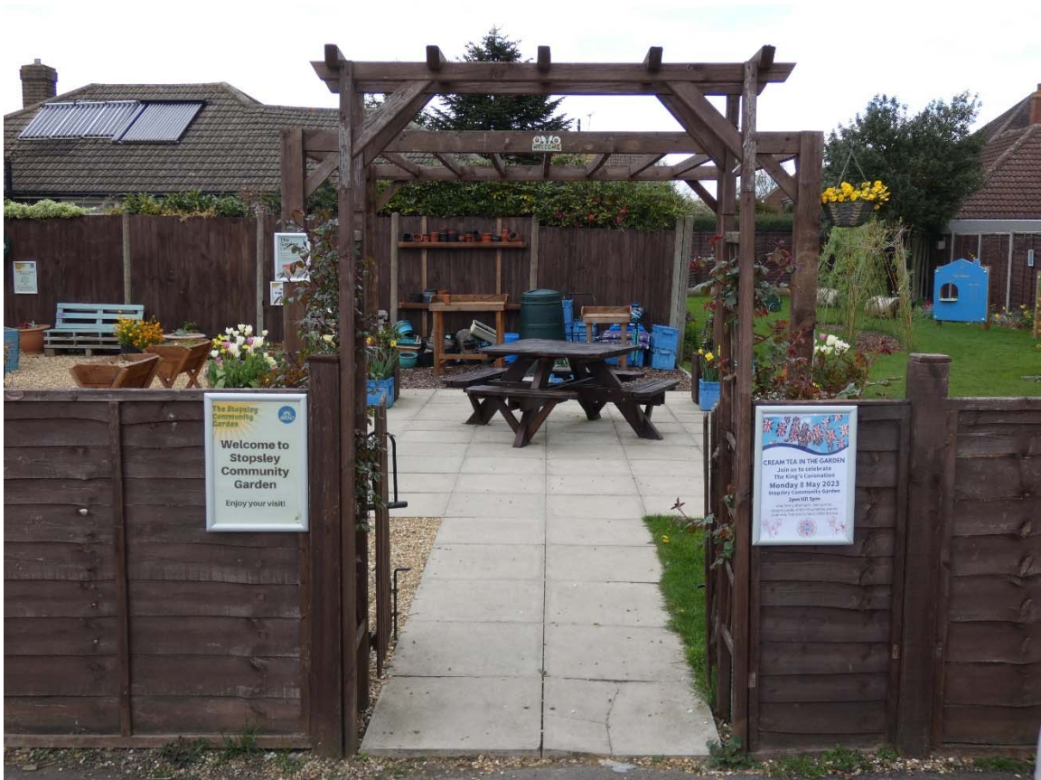
Community Garden current entrance