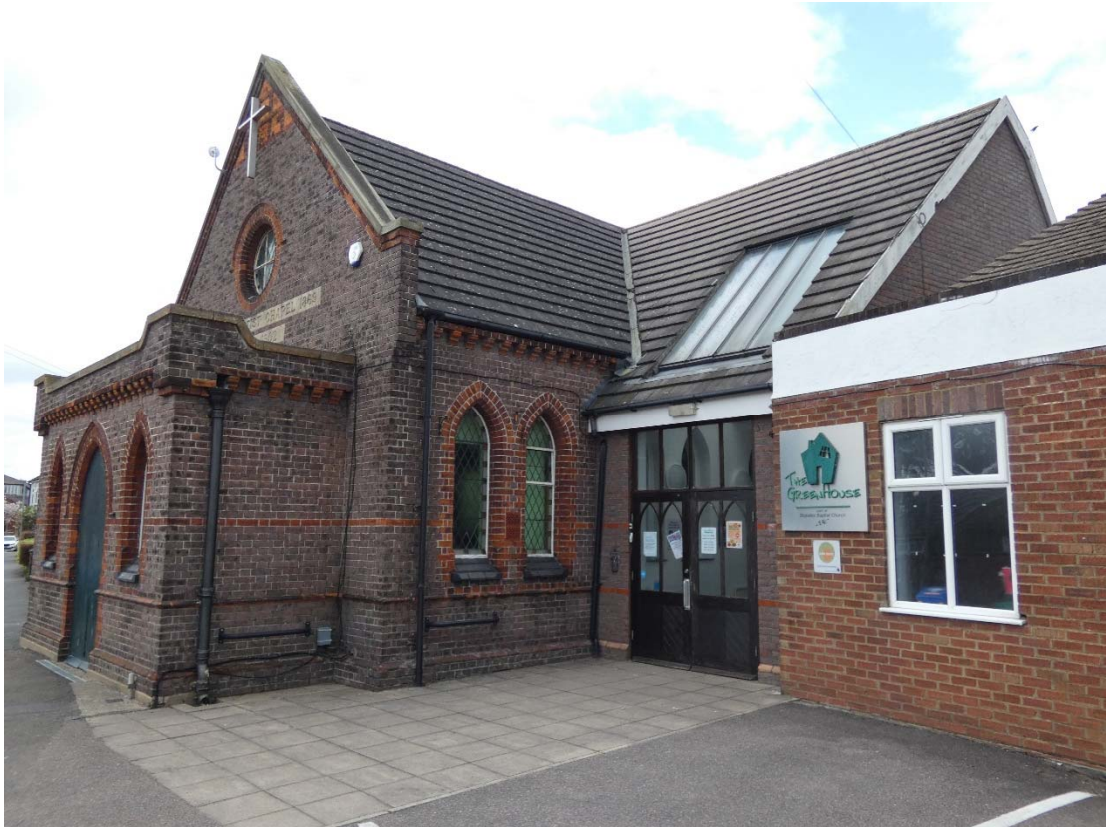
The Greenhouse: Old Chapel building and newer main entrance link with Janes Hall building