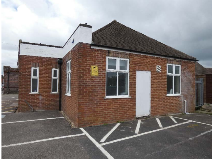
Janes Hall building east elevation proposed link to Community Garden