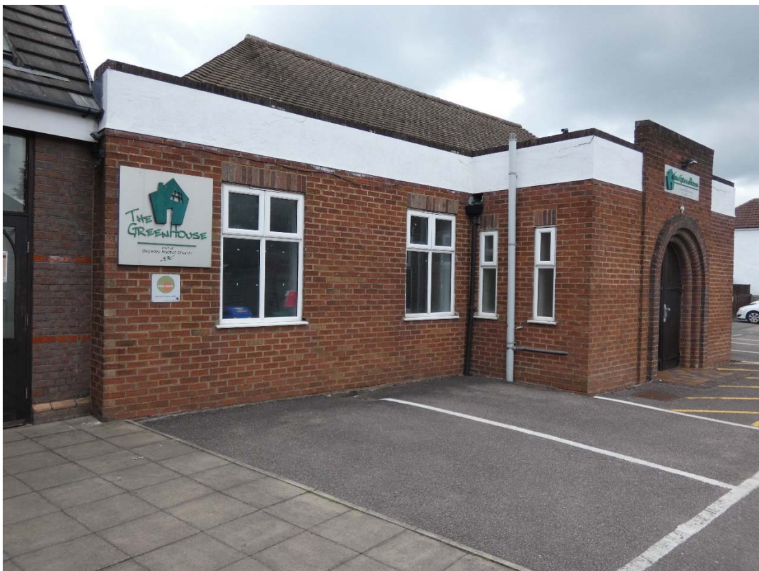
The Janes Hall building