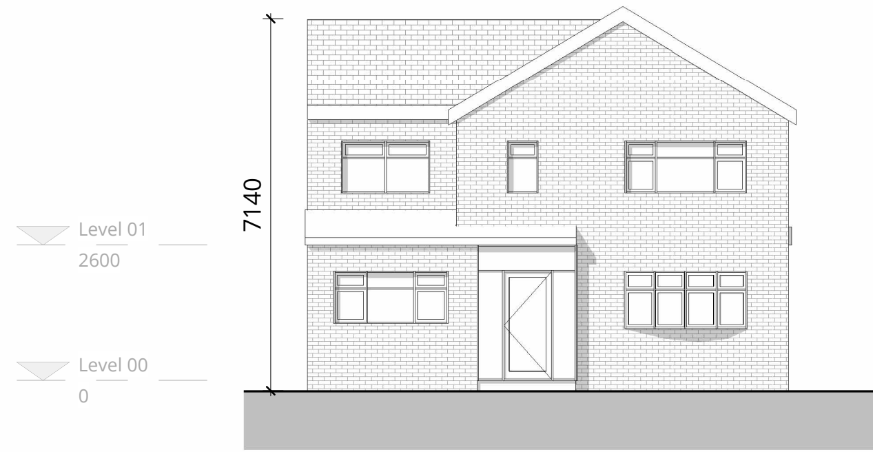
1 | Proposed Elevation Front 1:100