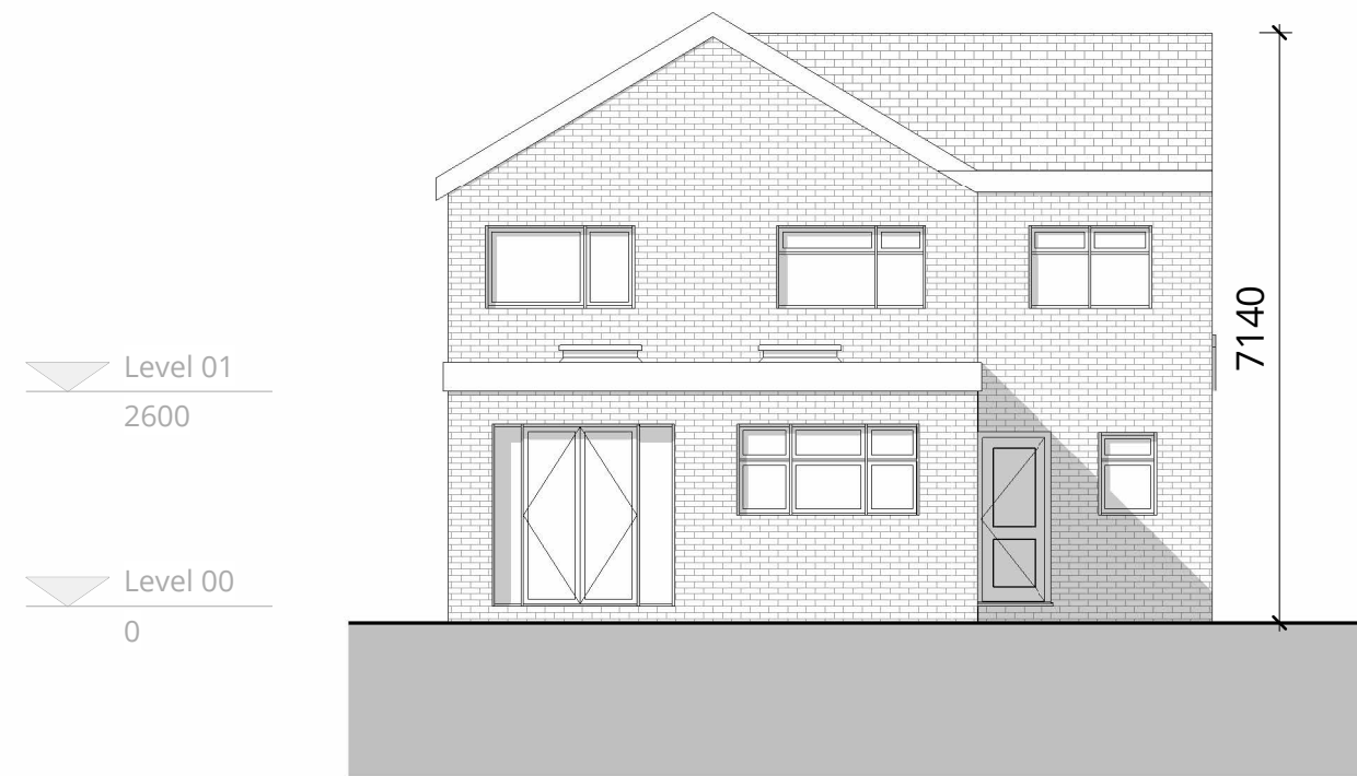
3 | Proposed Rear Elevation 1:100