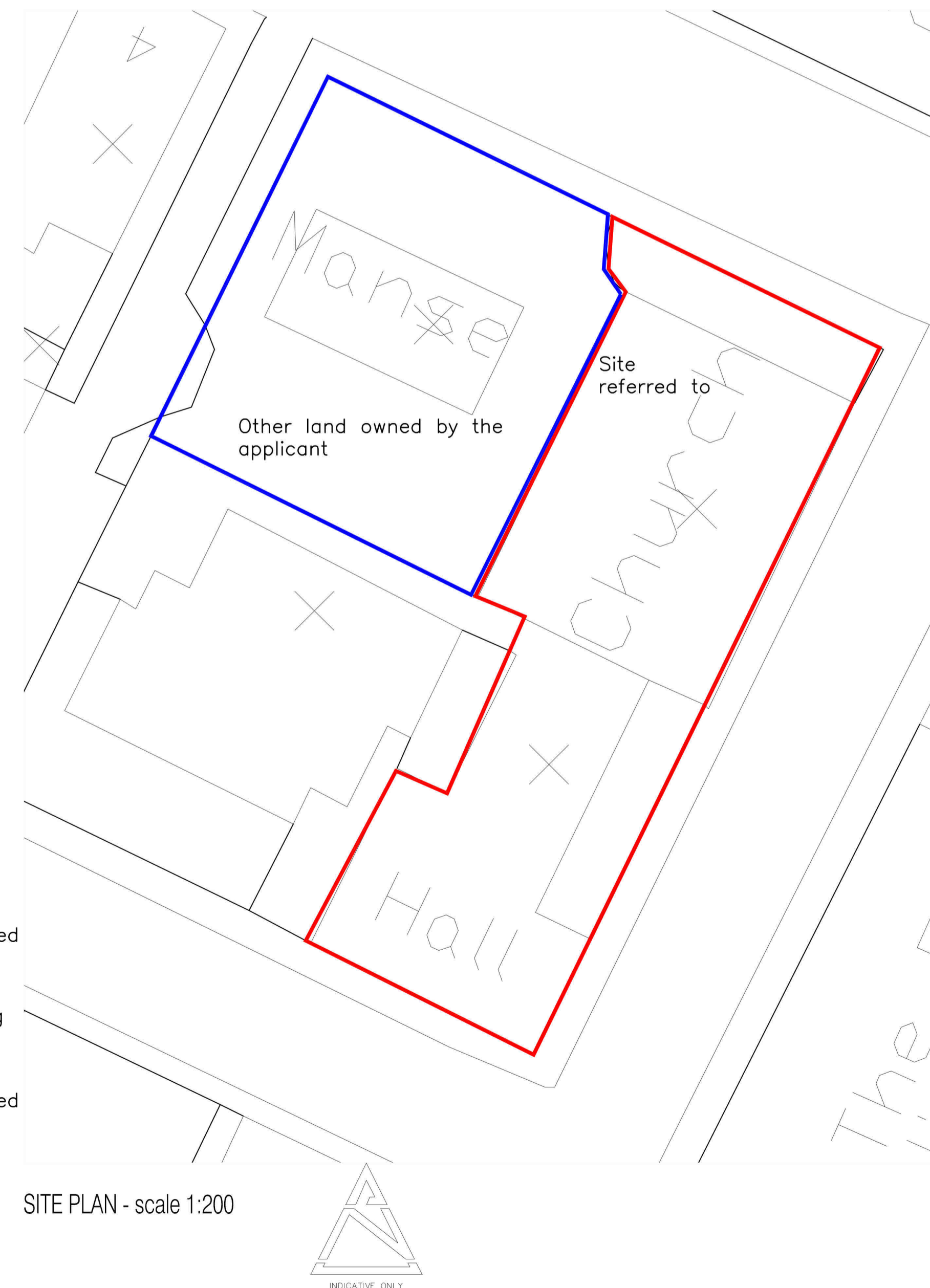
SITE PLAN - scale 1:200