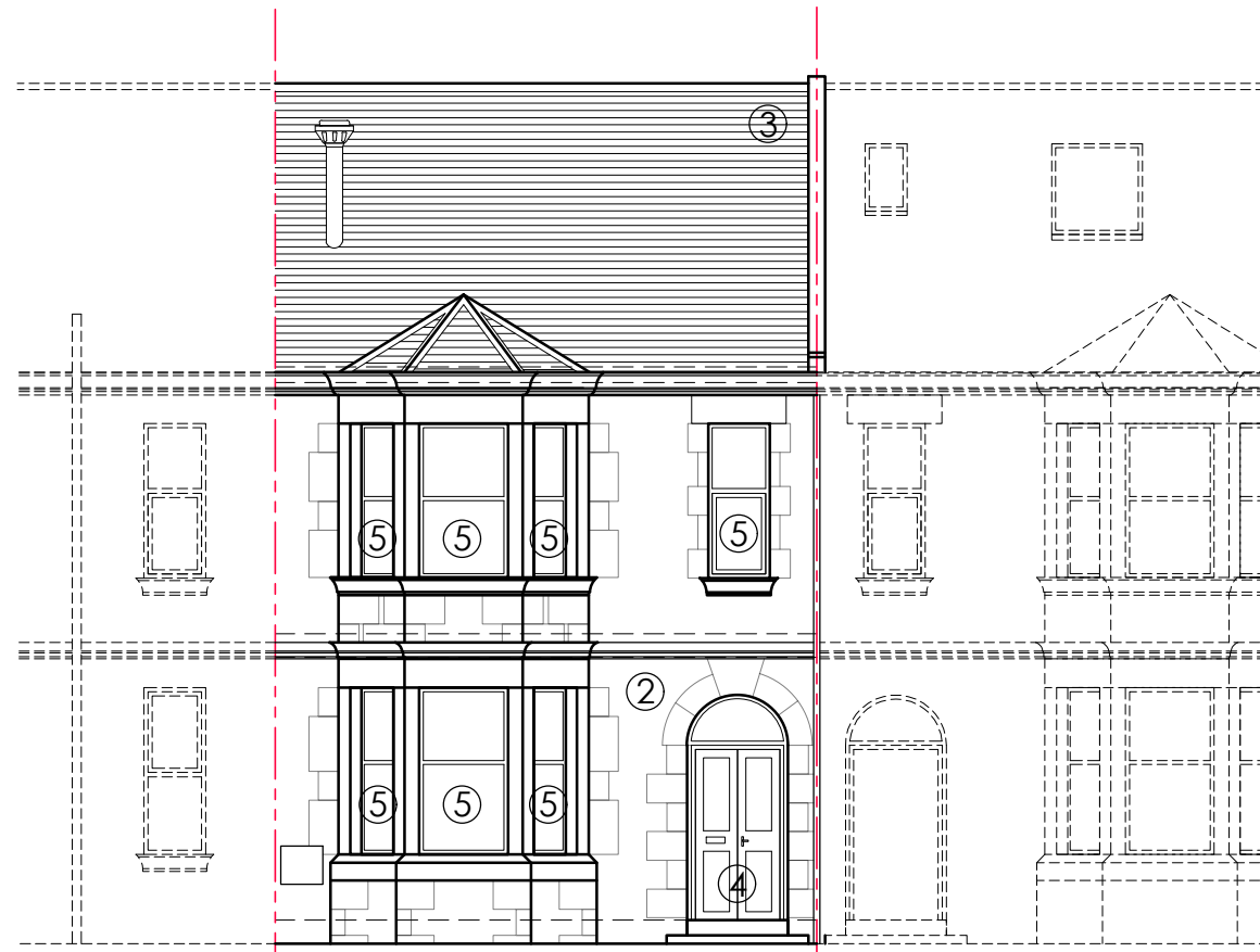
FRONT ELEVATION AS EXISTING