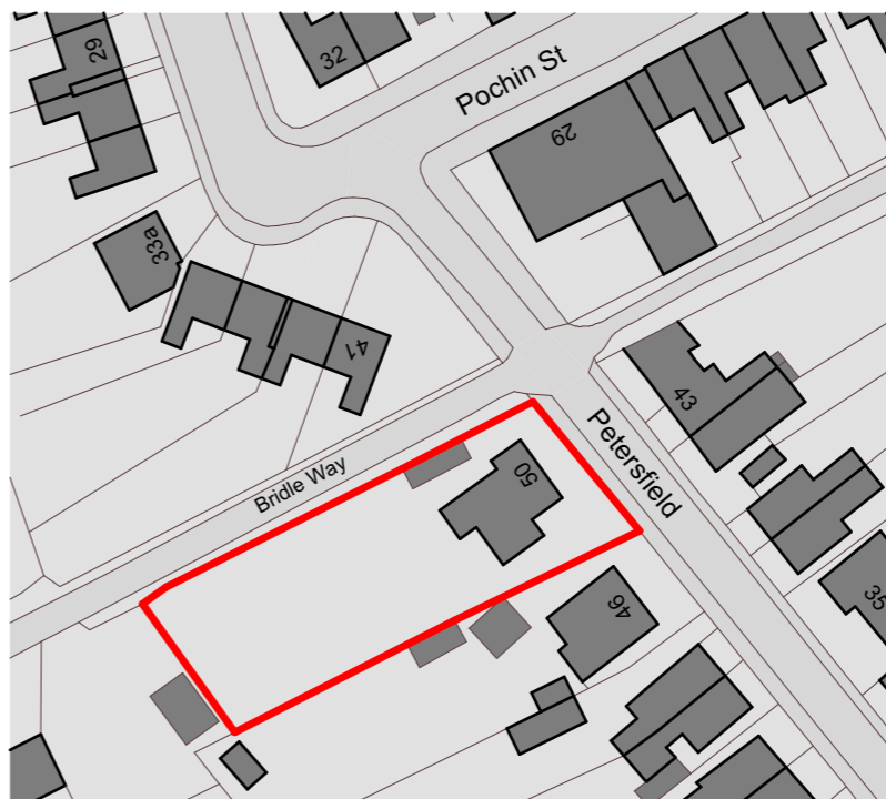
Location Plan 1:1000@A3