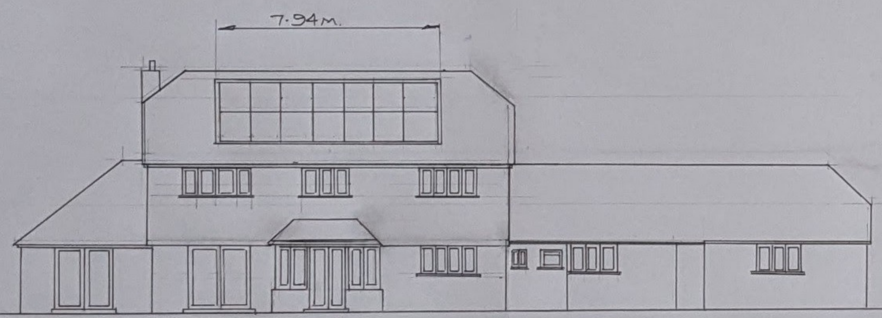
PROPOSED REAR ELEVATION (IN ROOF SOLAR PANELS 7.94M X 3.44M)