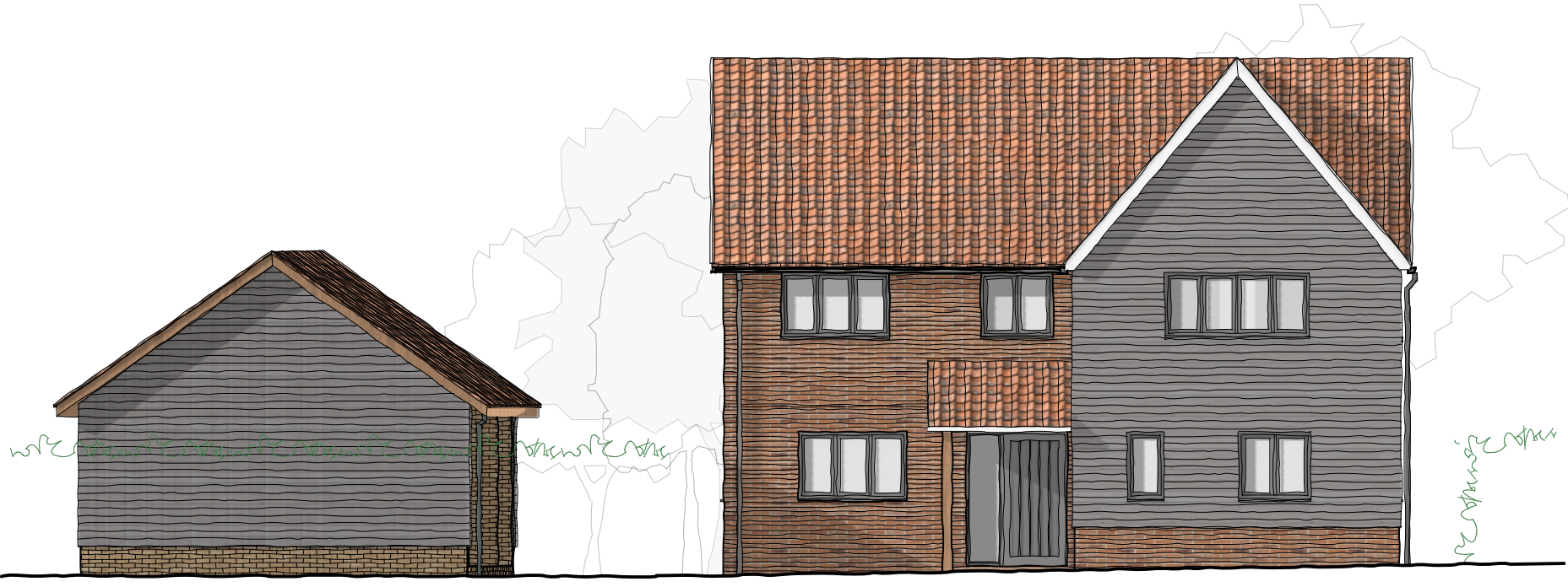
South Elevation Scale: 1:100