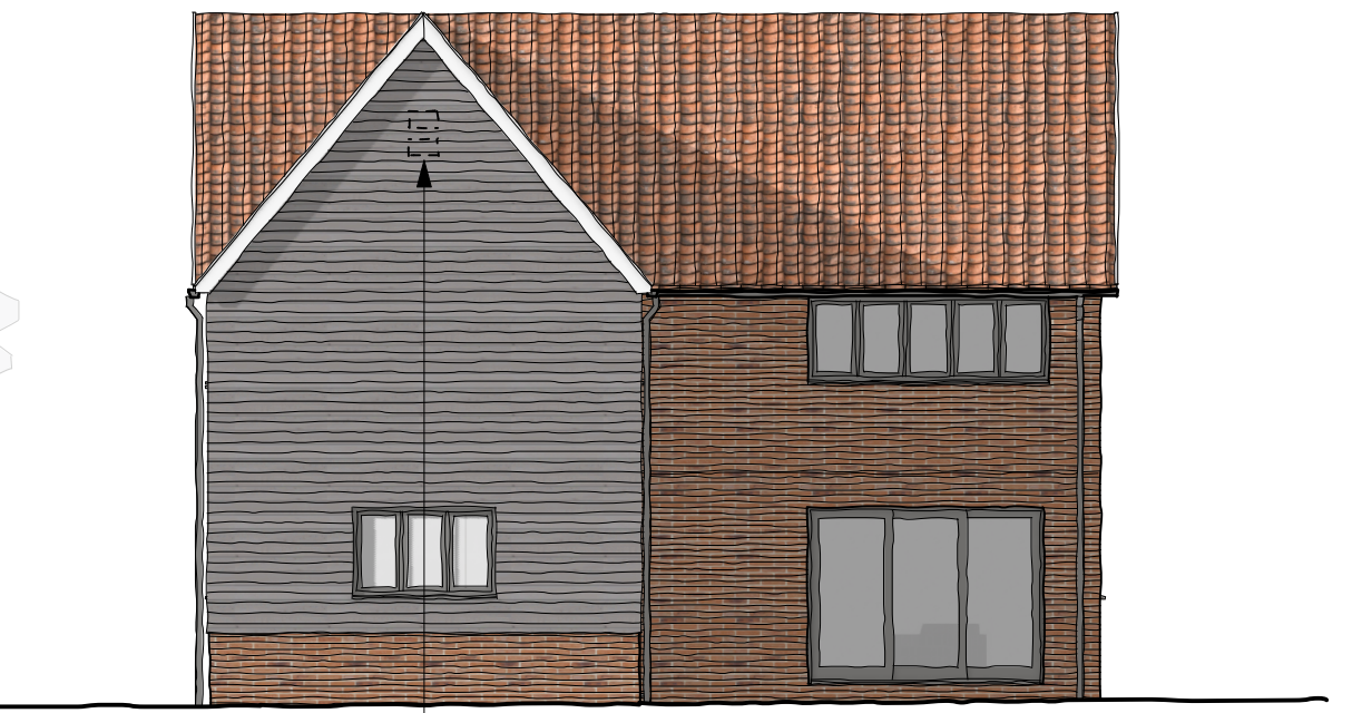
North Elevation Scale: 1:100

2 no. intergrated habitat bat boxes on east elevation to underside of overhanging roof