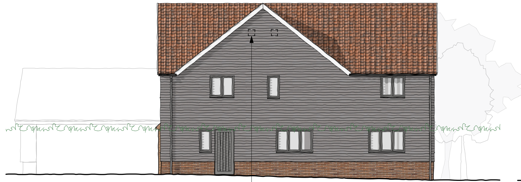
East Elevation Scale: 1:100