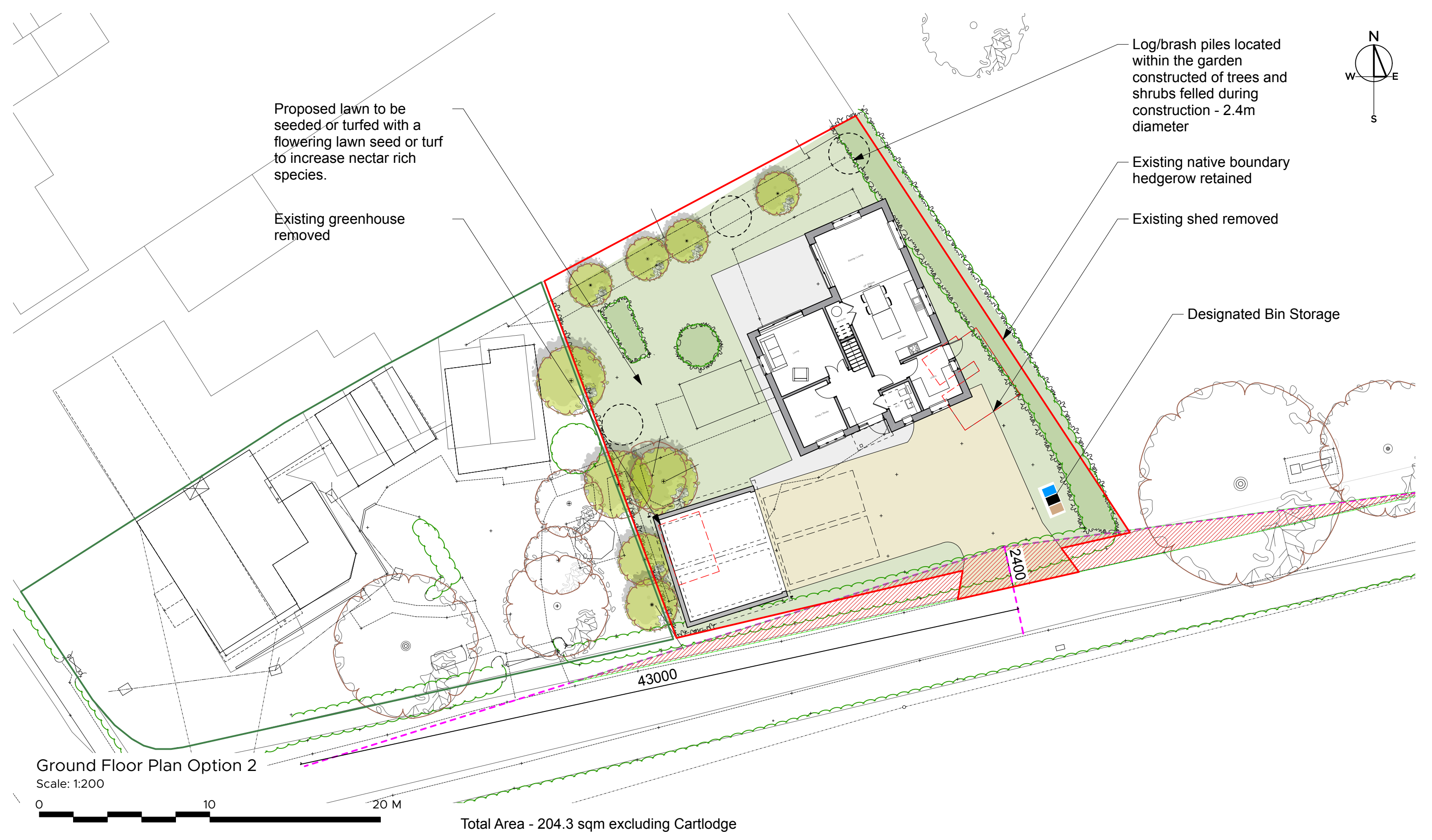
Ground Floor Plan Option 2