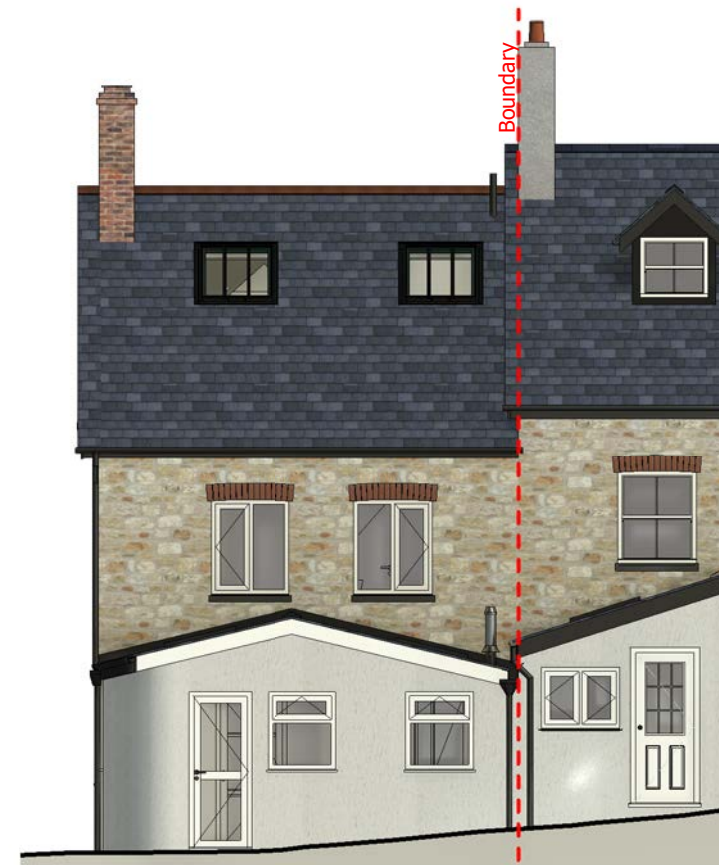
Proposed Rear (NW) Elevation 1 : 100