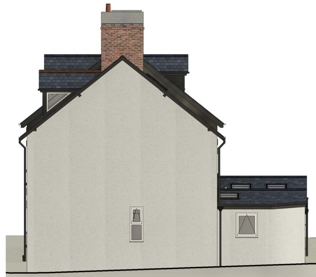
Proposed Side (NE) Elevation 1 : 100

These drawings are Copyright of PWS-Plans (Party Wall Surveying Limited). Surveys of existing are based on non-intrusive measurements being taken and assumption have been made to the construction of the existing. Existing wall sizes etc. are shown but do not detail the makeup which must be checked on site at commencement of the project. All sizes must be checked on site for construction and manufacturing purposes and all agreed with Building Control if relevant. These drawings must be read in conjunction with the Building Regulations (B.R.) Notes where attached.