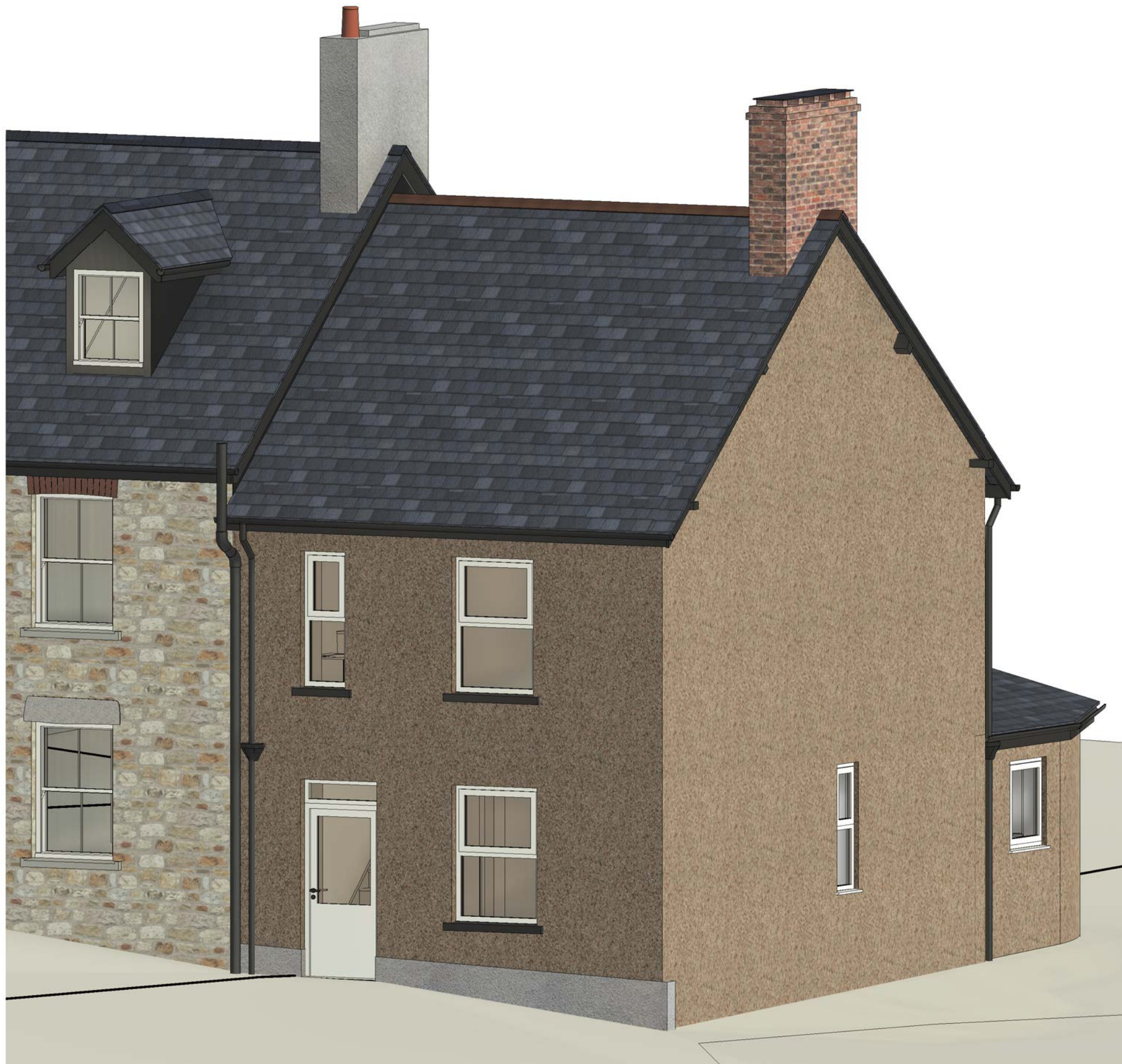
Existing SE View