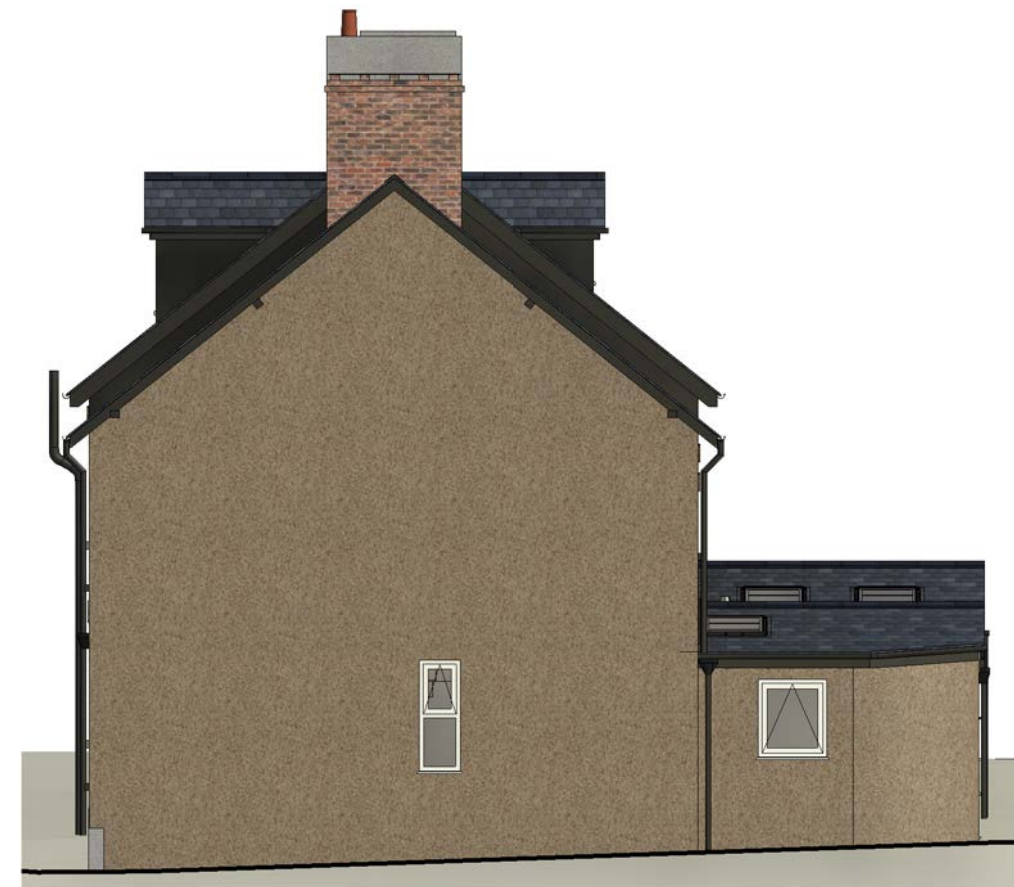
Existing Side (NE) Elevation