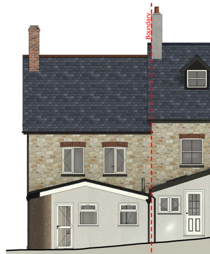
Existing Rear (NW) Elevation