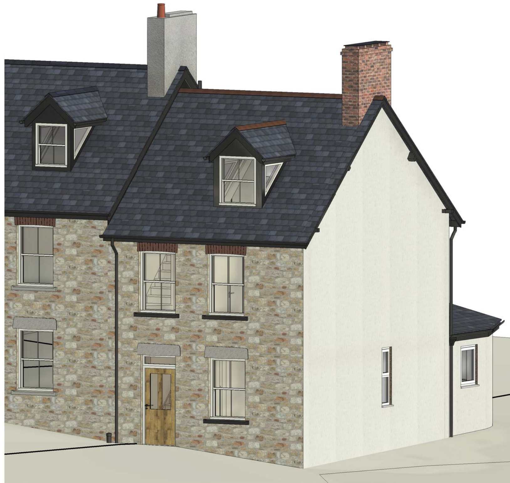
Proposed SE View