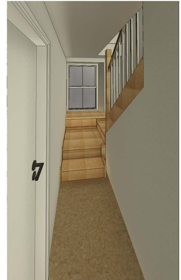
Loft Stairs Access