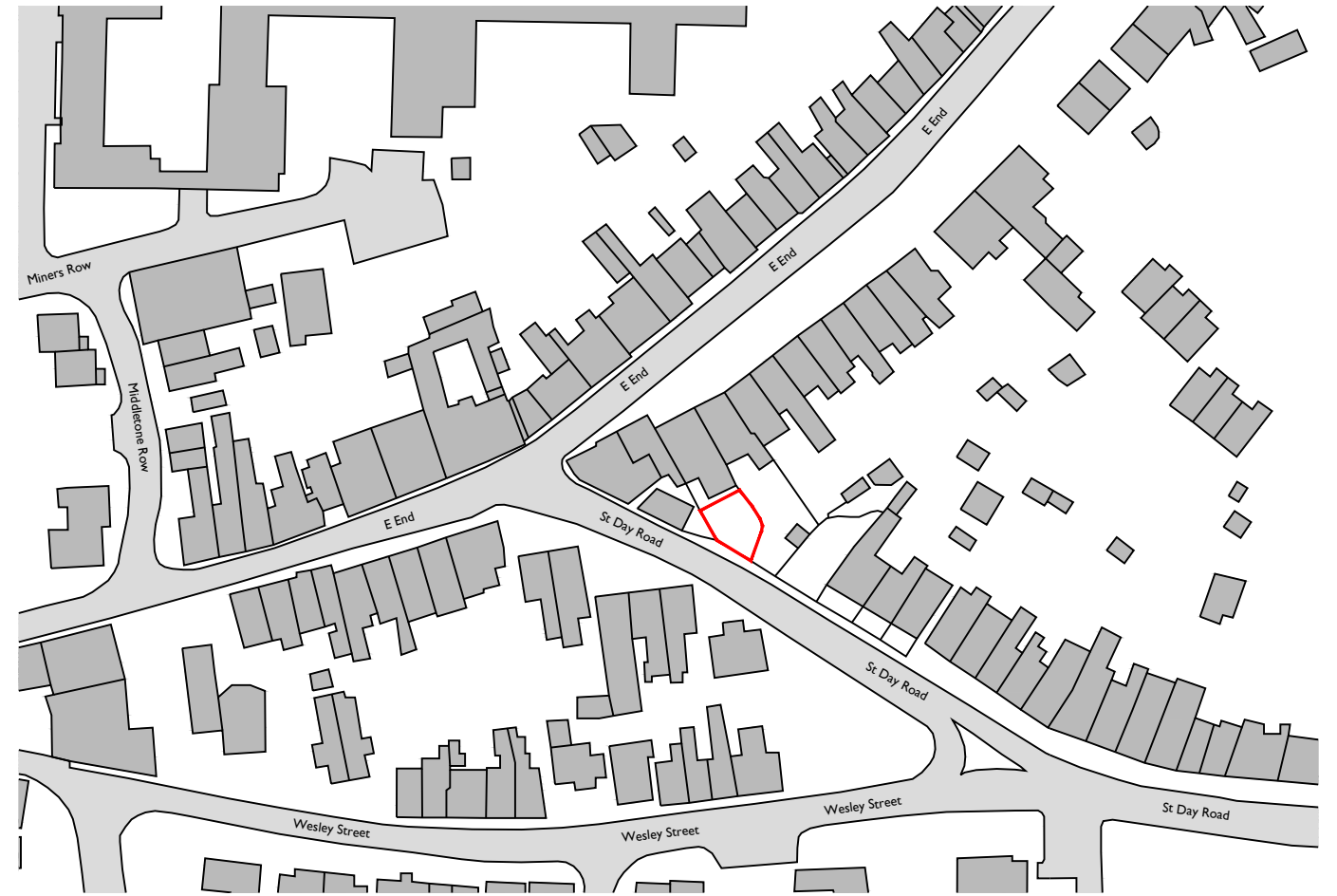
1:1250 Location Plan