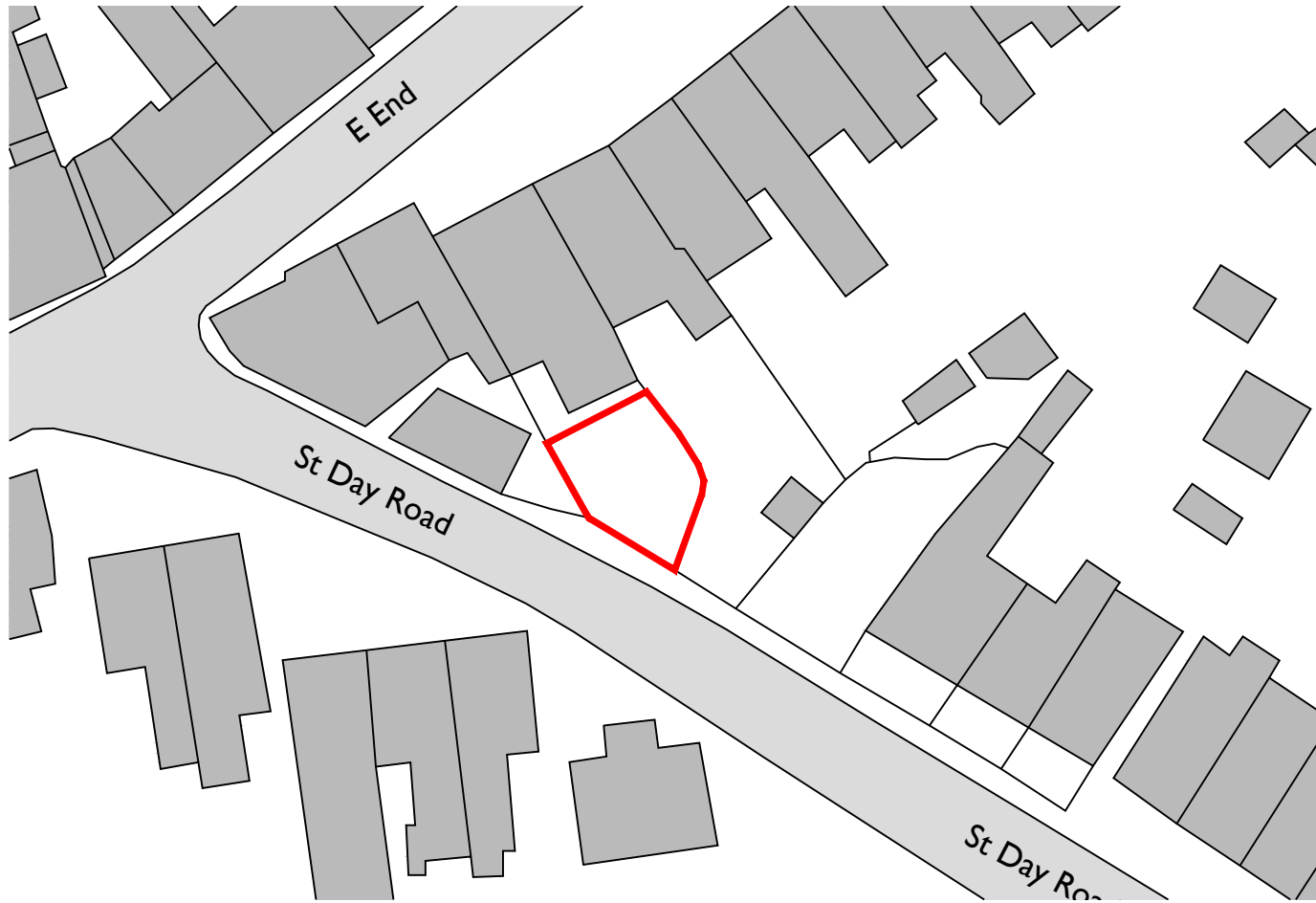
1:500 Block Plan