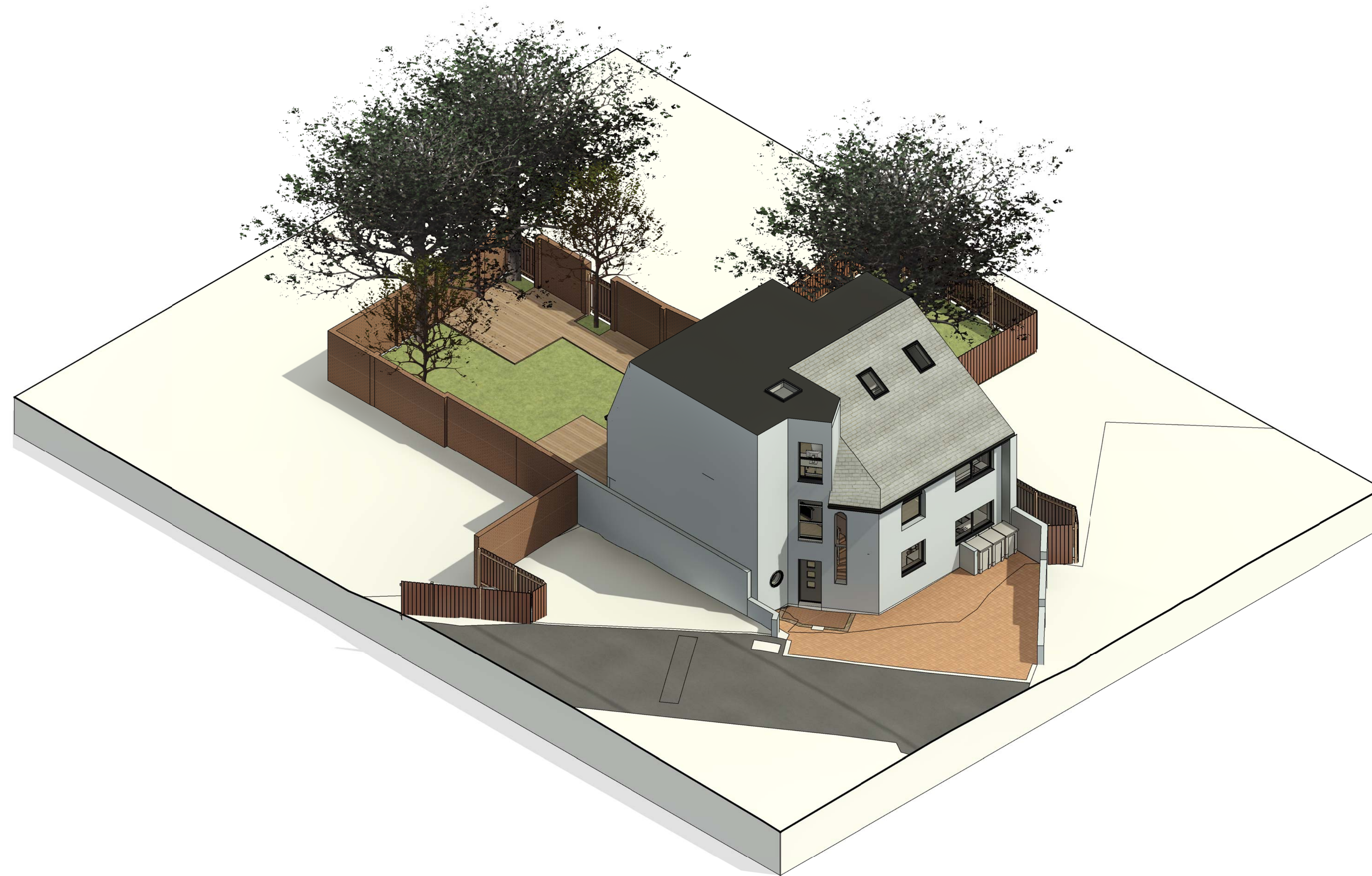
1 Existing 3D Axo A 20900

© COPYRIGHT The copyright in this drawing is vested in Mongillo Construction Workshop (MCW) and no license or assignment of any kind has been, or is, granted to any third party whether by provision of copies or originals or otherwise unless agreed in writing. DO NOT SCALE FROM THIS DRAWING The contractor shall check and verify all dimensions on site and report any discrepancies in writing to Mongillo Construction Workshop (MCW) before proceeding work. FOR ELECTRONIC DATA ISSUE Electronic Data / drawings are issued as "read only" and should not be interrogated for measurement. All dimensions and levels should read, only from those values stated in text, on the drawing.