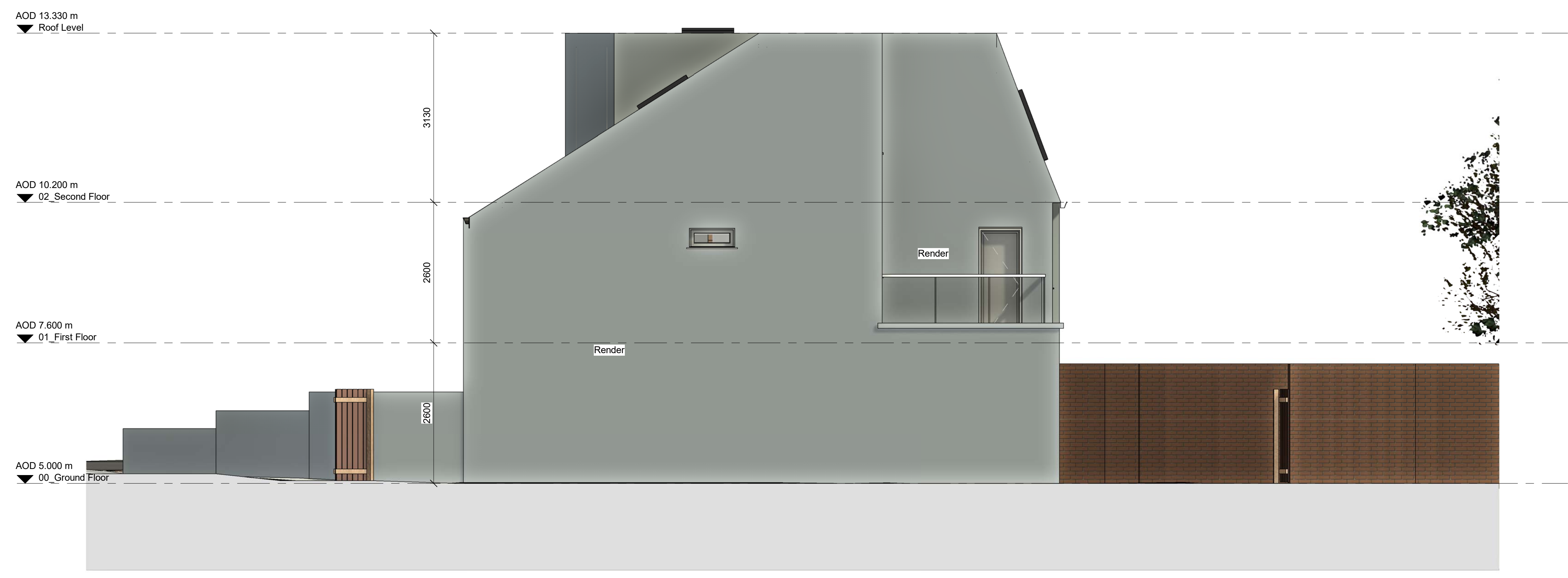
1 Existing West Elevation 20203 1 : 50

AREA MEASUREMENT The areas are approximate and can only be verified by a detailed dimensional survey of the completed building. Any decisions to be made on the basis of these predictions, whether as to project viability, pre-letting, lease agreements or the like, should include due allowance for the increases and decreases inherent in the design development and building processes. Figures relate to the likely areas of the building at the current state of the design and using the Gross External Area (GEA) / Gross Internal Area (GIA) / Net Internal Area (NIA) method of measurement from the Code of Measuring Practice, 6th Edition (RICS Code of Practice). All areas are subject to Town Planning and Conservation Area Consent, and detailed Rights to Light analysis.