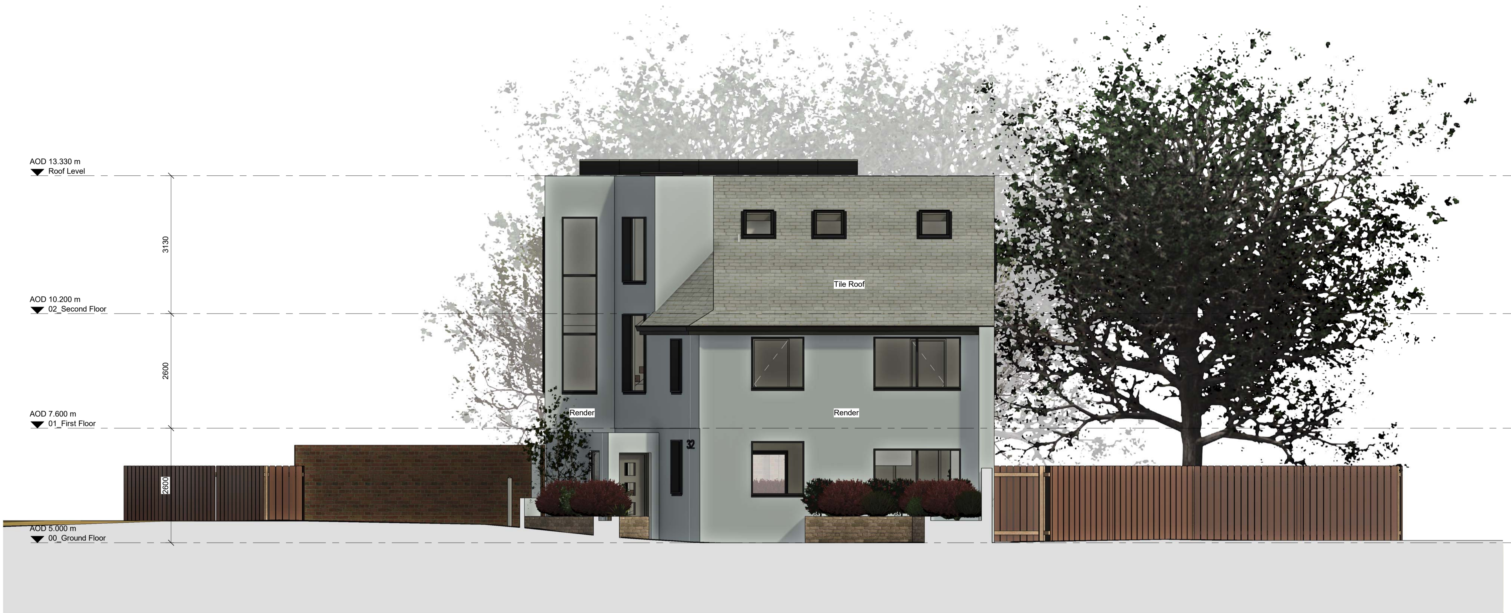
1 Proposed North Elevation 20250 1 : 50