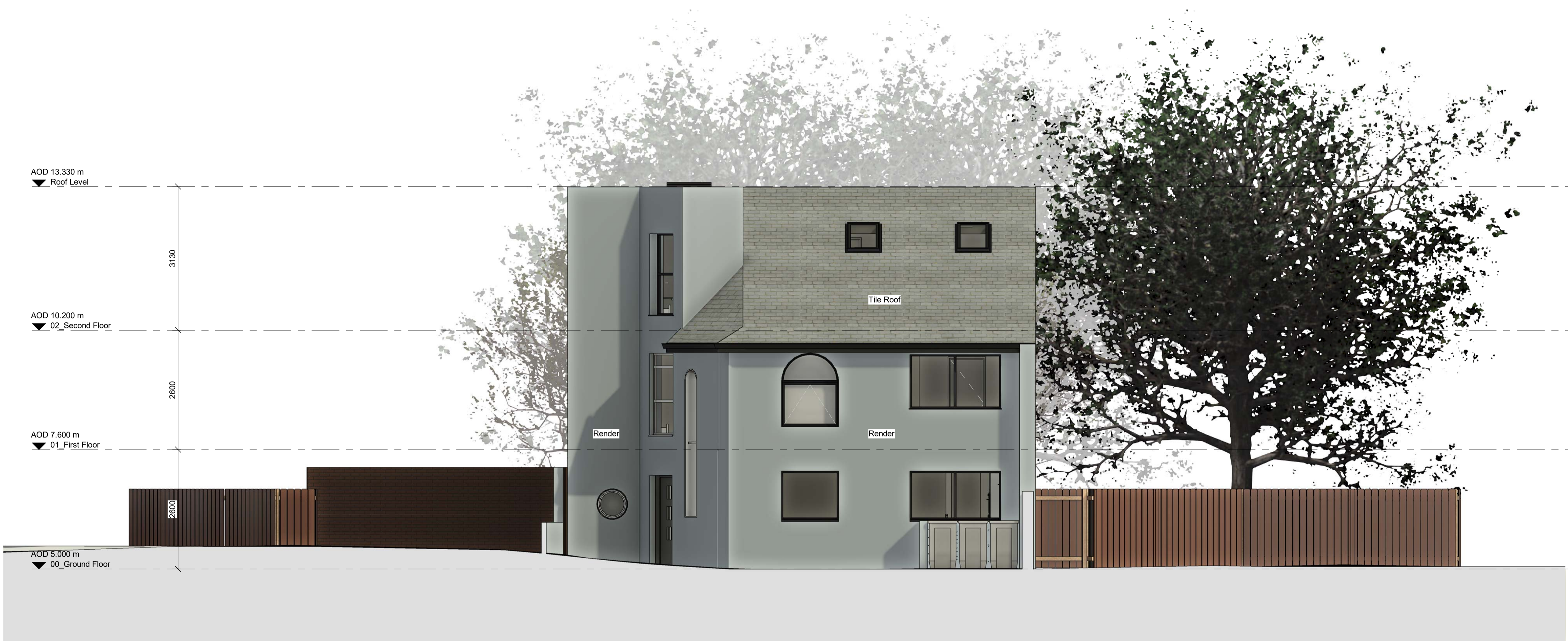
1 Existing North Elevation 20200 1 : 50

AREA MEASUREMENT The areas are approximate and can only be verified by a detailed dimensional survey of the completed building. Any decisions to be made on the basis of these predictions, whether as to project viability, pre-letting, lease agreements or the like, should include due allowance for the increases and decreases inherent in the design development and building processes. Figures relate to the likely areas of the building at the current state of the design and using the Gross External Area (GEA) / Gross Internal Area (GIA) / Net Internal Area (NIA) method of measurement from the Code of Measuring Practice, 6th Edition (RICS Code of Practice). All areas are subject to Town Planning and Conservation Area Consent, and detailed Rights to Light analysis.