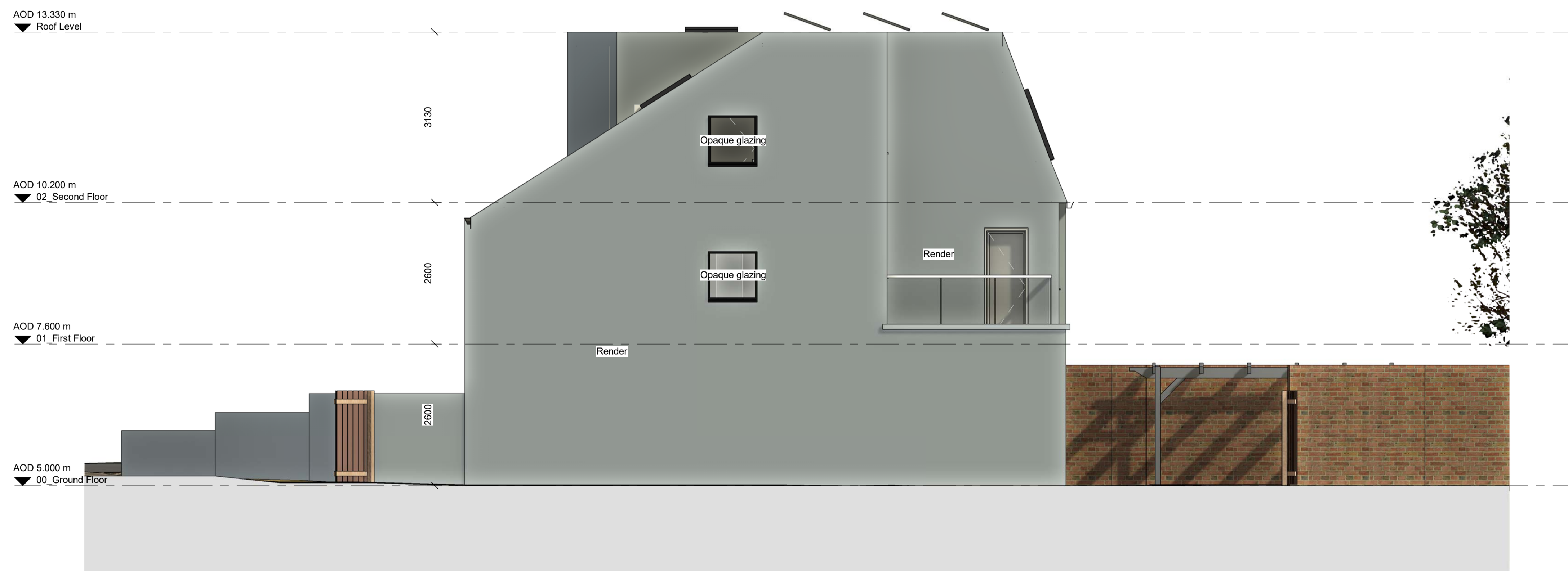
1 Proposed West Elevation 20253 1 : 50

AREA MEASUREMENT The areas are approximate and can only be verified by a detailed dimensional survey of the completed building. Any decisions to be made on the basis of these predictions, whether as to project viability, pre-letting, lease agreements or the like, should include due allowance for the increases and decreases inherent in the design development and building processes. Figures relate to the likely areas of the building at the current state of the design and using the Gross External Area (GEA) / Gross Internal Area (GIA) / Net Internal Area (NIA) method of measurement from the Code of Measuring Practice, 6th Edition (RICS Code of Practice). All areas are subject to Town Planning and Conservation Area Consent, and detailed Rights to Light analysis.